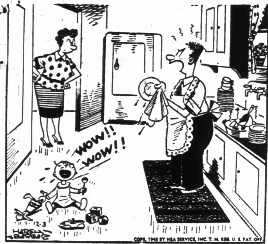
"I'll bet he thinks I'm his mother!"