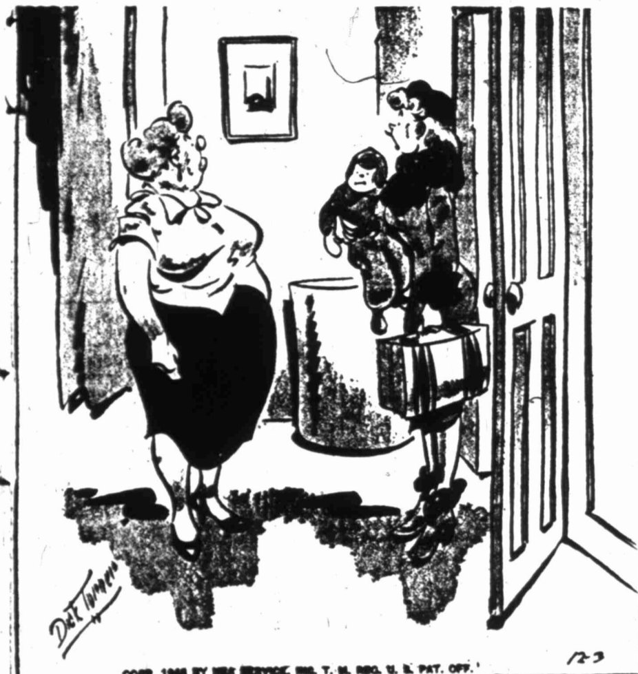
"Why not come along and spend a few days with us, mother? Why, George said he'd bet a thousand dollars you'd come and spend the whole winter!"