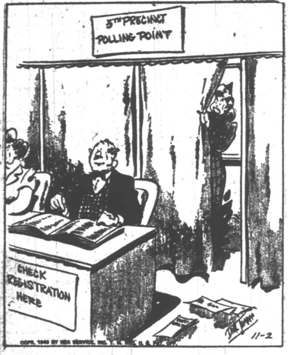
"How do you cast a blackball?"