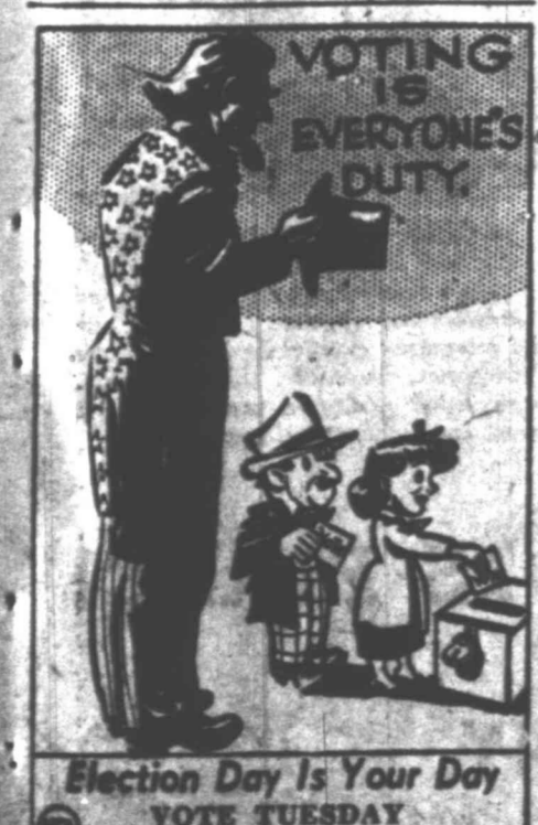
Election Day Is Your Day VOTE TUESDAY

TOLEDO, OHIO (AP)—An unidentified crew member was reported dead Tuesday as the result of a collision between two lake freighters during a fog on Lake Erie.