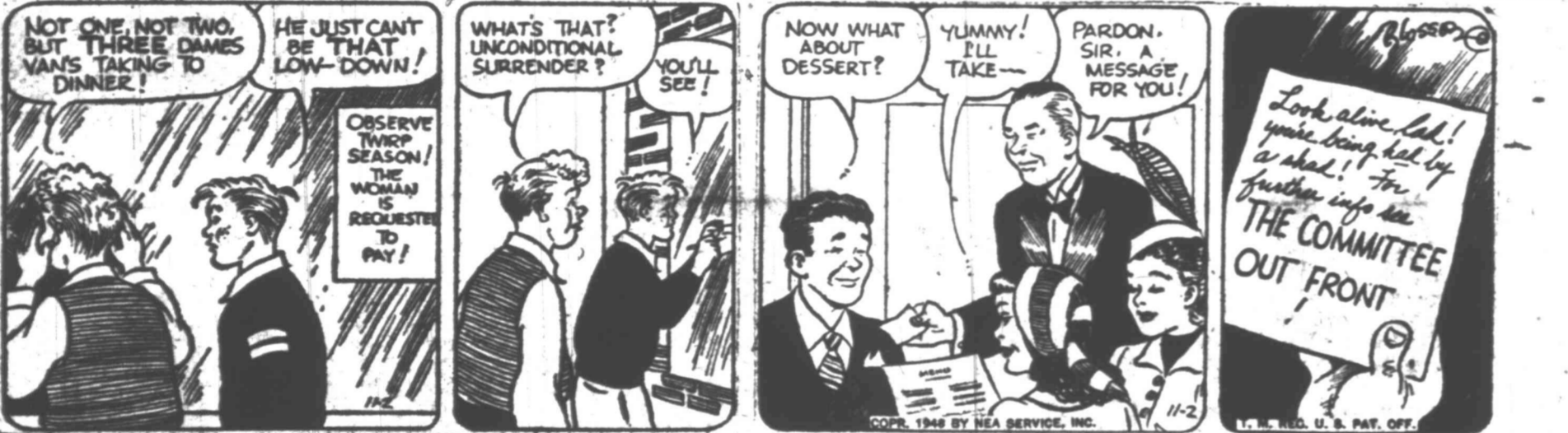
—By Merrill Blosser