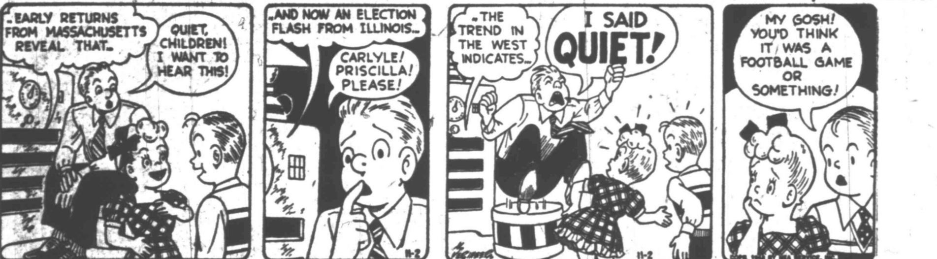
—By Al Vermeer