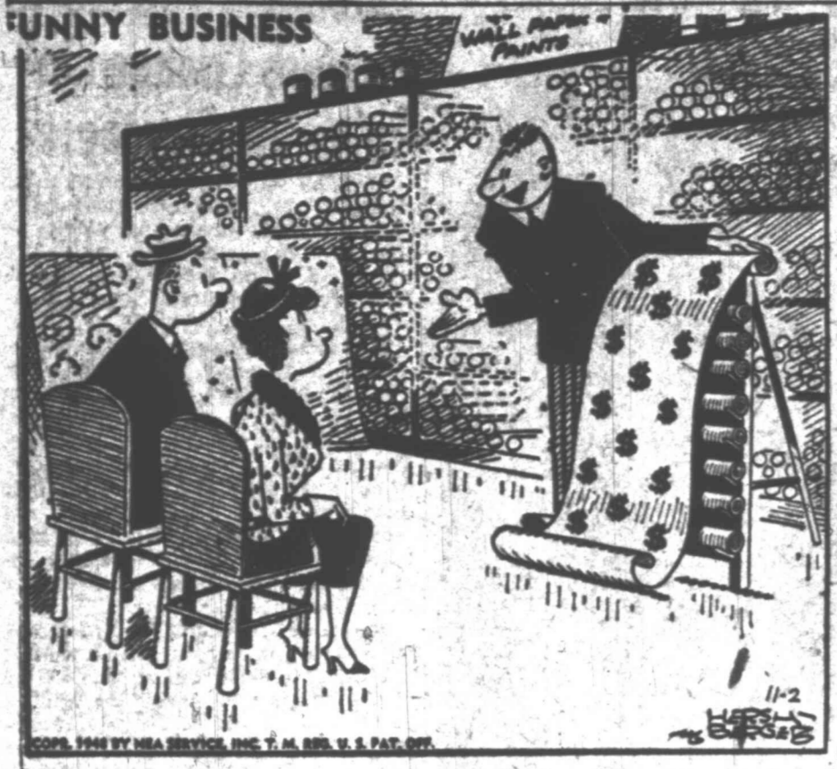
"This is a very appropriate pattern for the kitchen!"