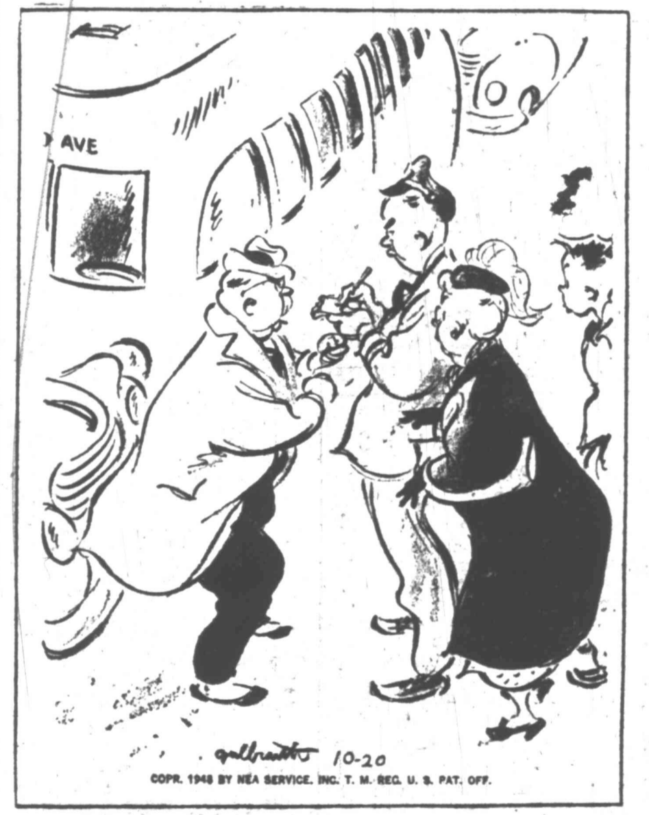
"Your bus is so big you think you can go around sideswiping any car you like—you saw what happened to Hitler!"