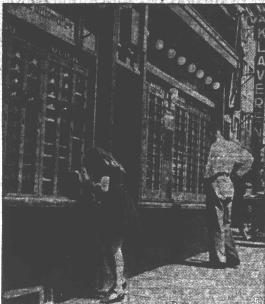
The industrious Dutch modernize the sidewalk cafe by building this "sidewalk automat" in Amsterdam. You can drop in a coin and get anything and everything from soup to nuts.