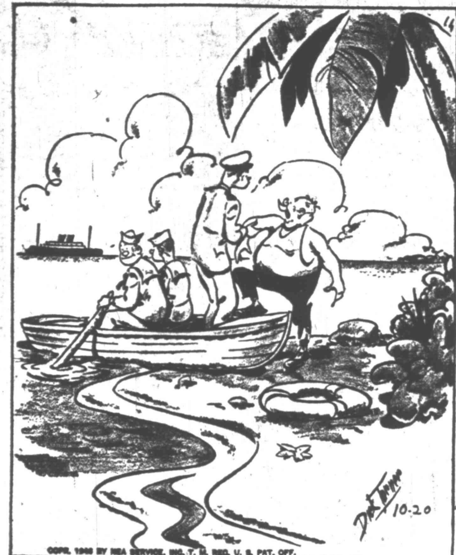
"Boy! I can just see the expressions on my heirs' faces!"