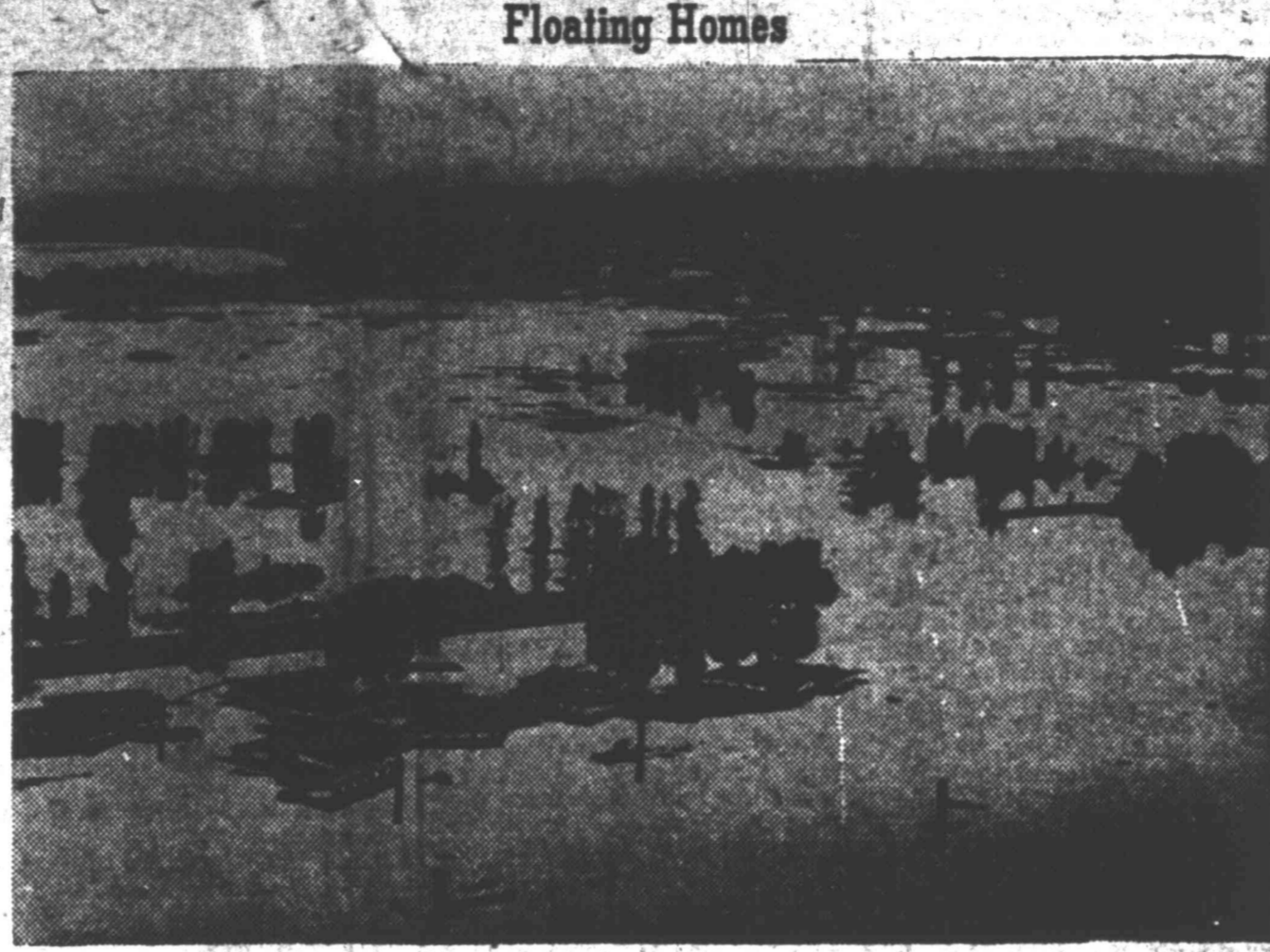
Debris and two-story, six-unit apartments float toward the 500-foot wide washout in the road at Vanport, Ore., after the highway was lost to the raging flood waters. Thousands are homeless and an undetermined number are dead in this flood-stricken area.

WASHINGTON (AP)—The United States and the leading countries of Western Europe Wednesday announced provisional agreement on plans for the future development of Western Germany. It reportedly includes full German participation in the European Recovery Program.