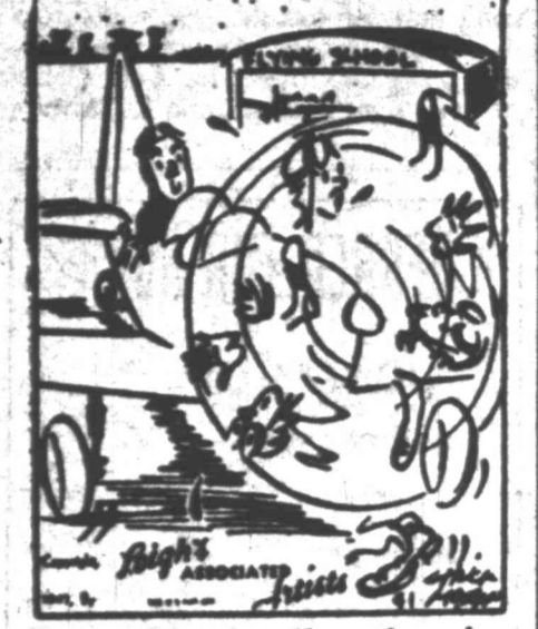
"If I told you once I told you a thousand times... Nothing is so careful."