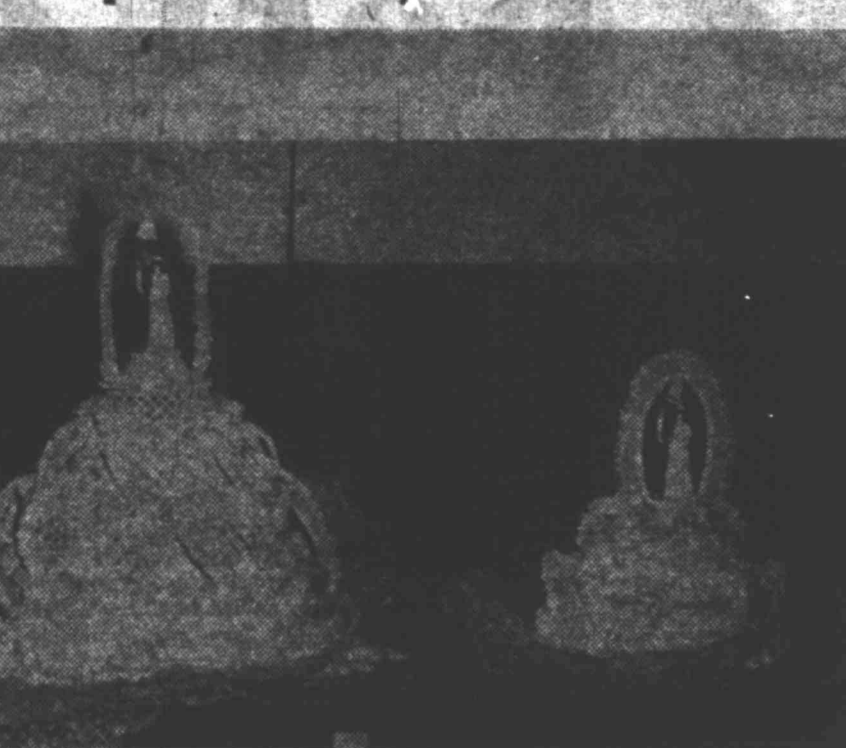
Walker's Bakery, 119 South Main Street in Midland, features custom-made cakes, pies and other pastries for those special occasions when an out-of-the-ordinary dessert is needed. Hosts and hostesses are invited to call the bakery, at telephone number 1101, for details concerning special bride-and-groom, birthday party, and other custom-made cakes.