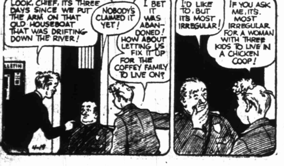
—By MERRILL BLOUSER