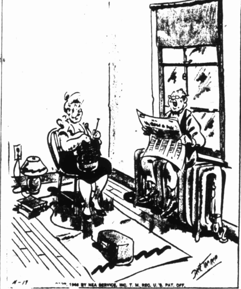
"Kinda lonesome around here, isn't it, Pet, since we got daughter married and settled in that little place of her own?"