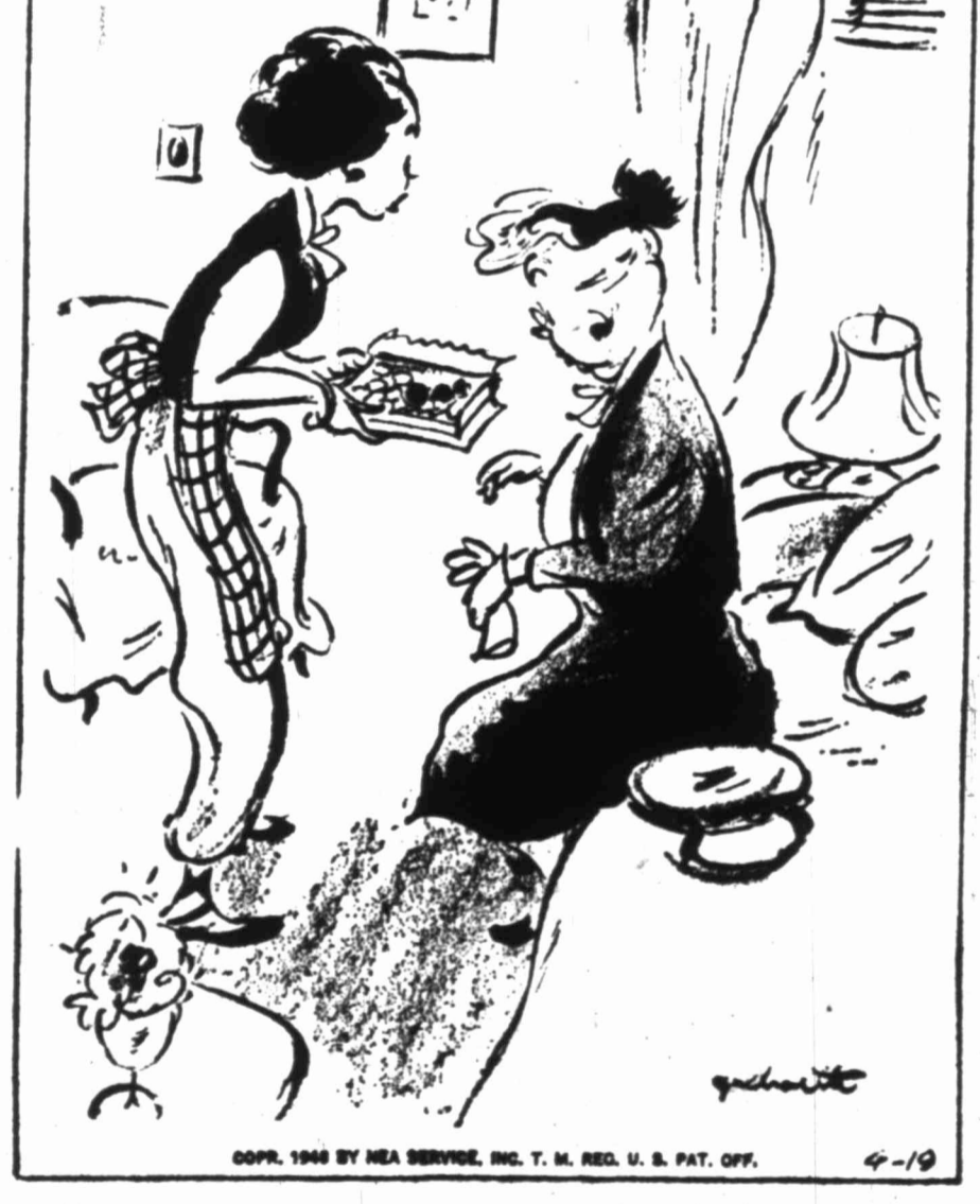
"Every time we quarrel he brings home a box of candy as a peace offering—but there isn't much left after he gets through with it!"