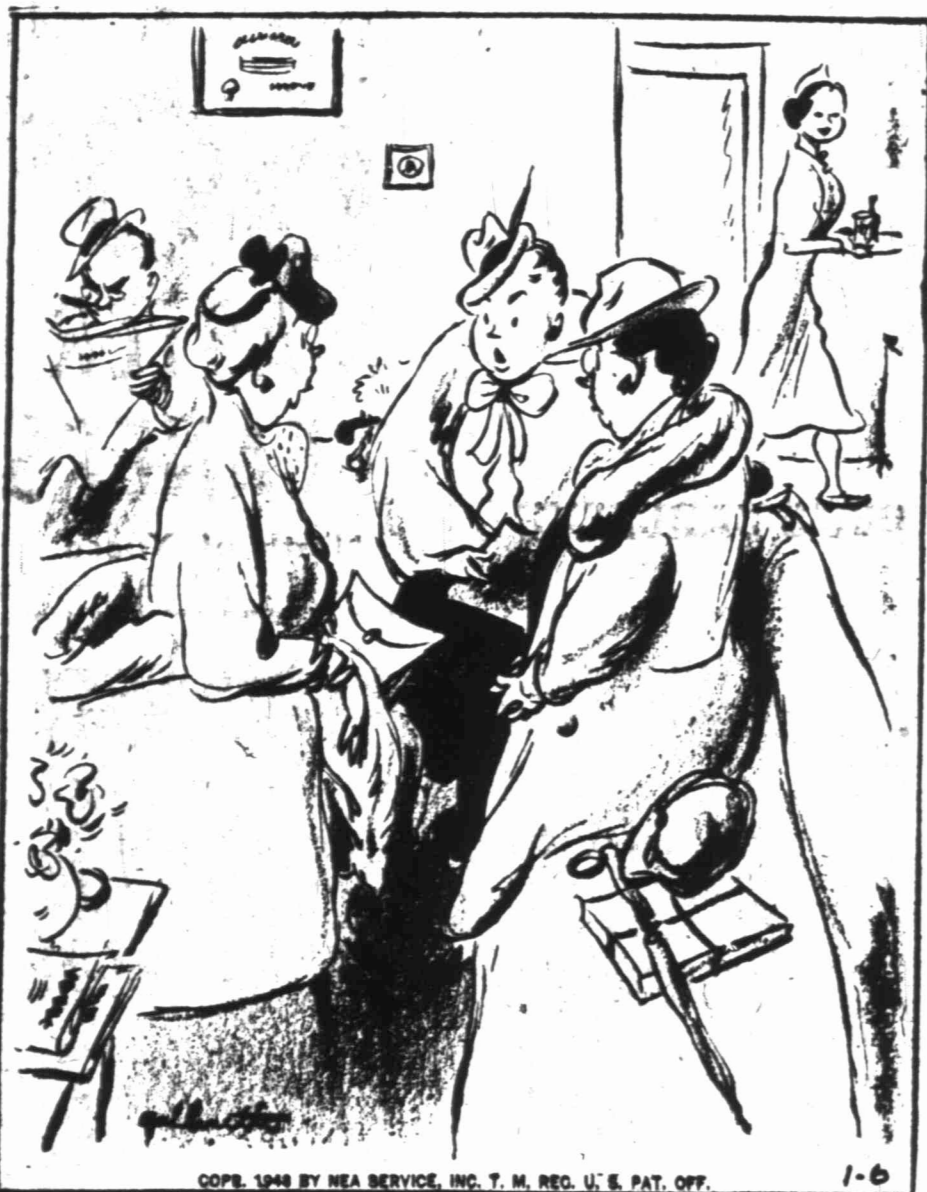
"I'm beginning to lose faith in Dr. Brown—he never tells me I've got what I think I have!"