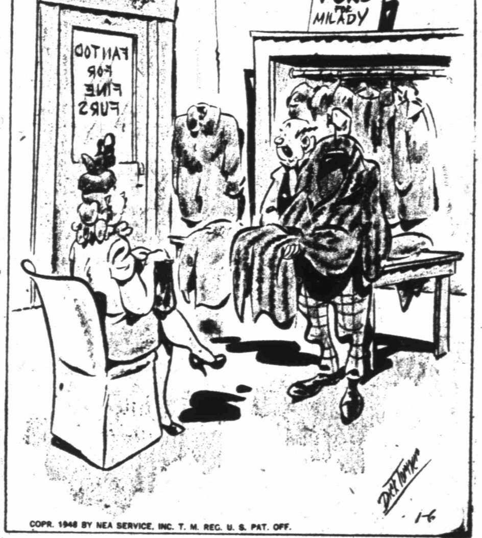
"For a quick sale I can let you have this gorgeous number at a big reduction—my wife's got her eye on it!"