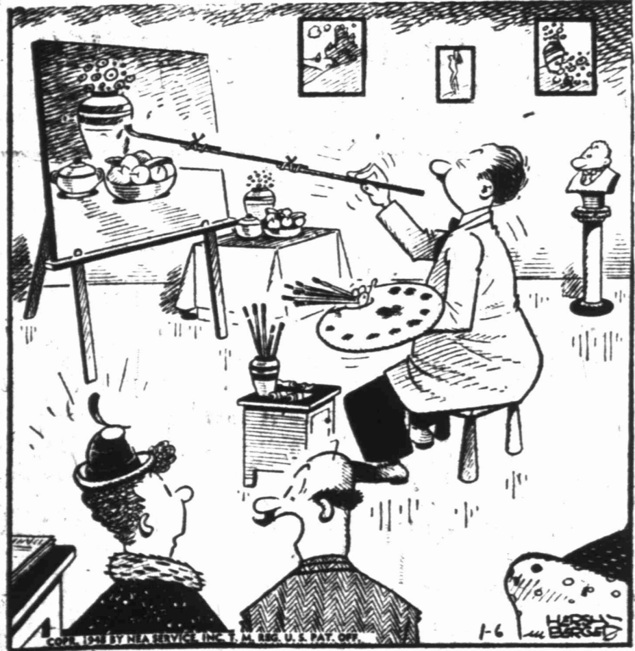
"He still refuses to believe he needs glasses!"