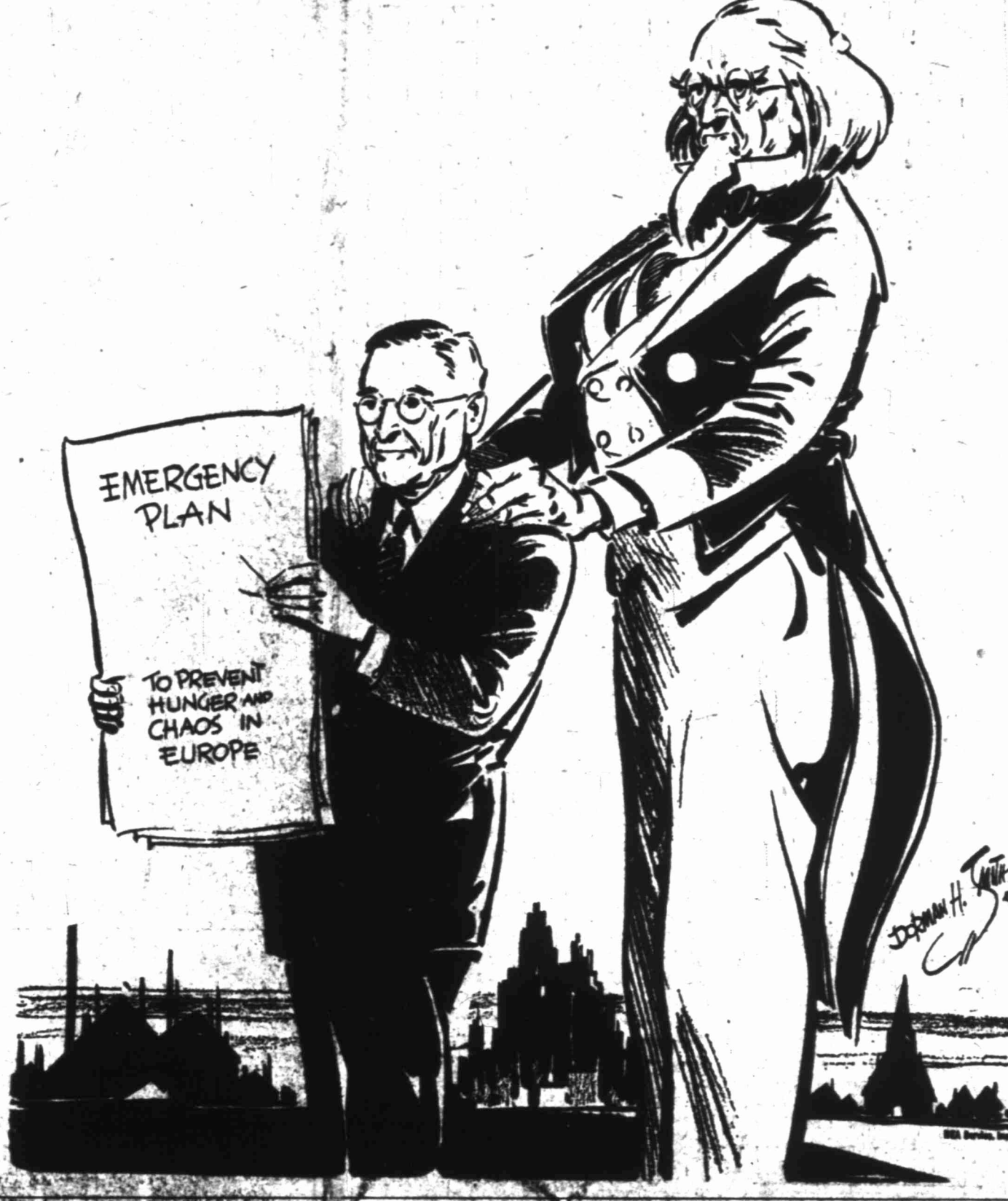
'This Is Where I Stand On The Matter, Mr. President'