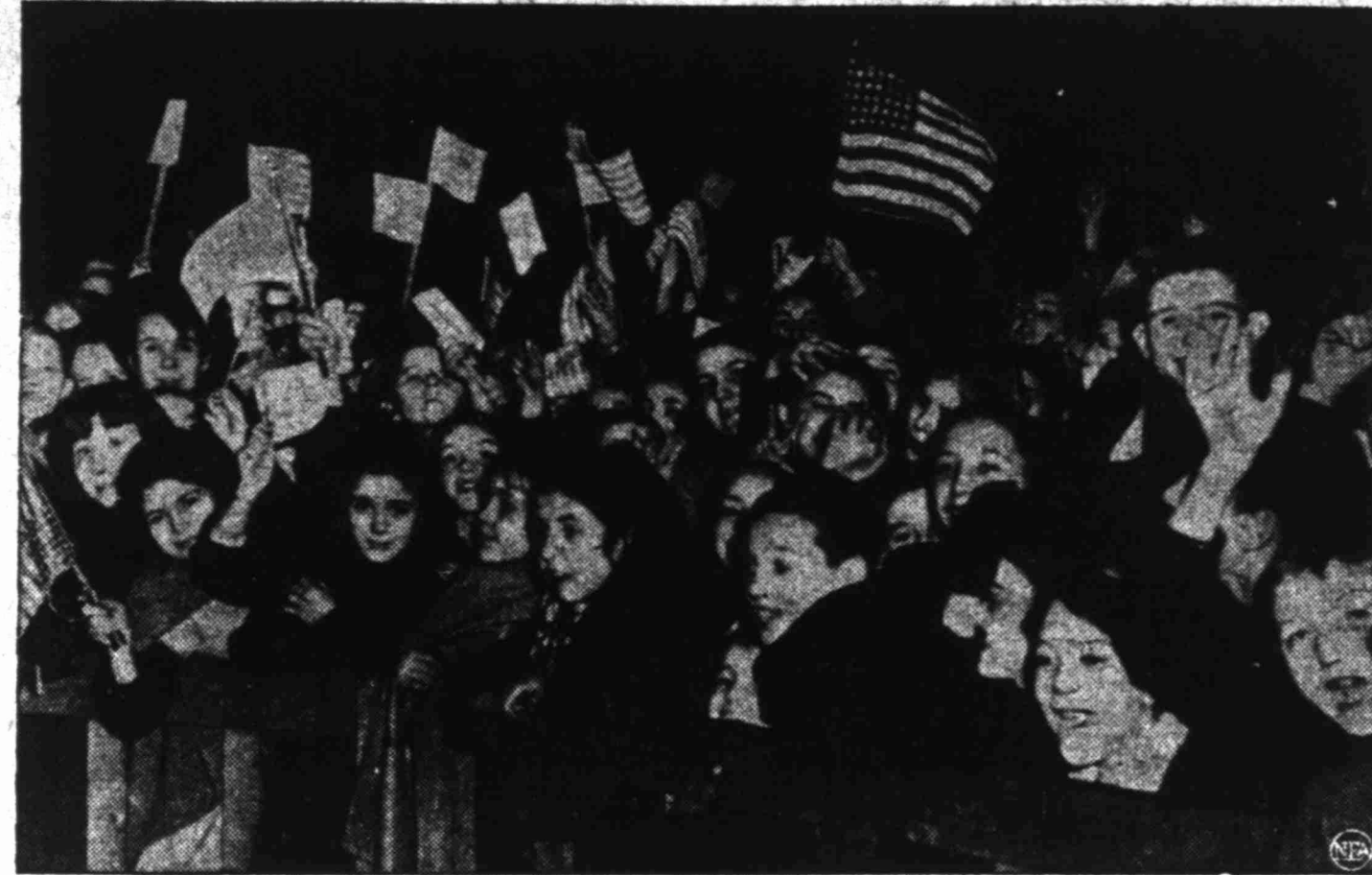
Waving U. S. flags, this crowd of French youngsters cheers the American people for their contributions of food to the Friendship Train. They participated in ceremonies at the Paris City Hall.