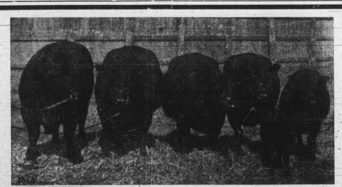
Champion Aged Herd at National Feeders' and Breeders' Show, Fort Worth, Texas, March 11-18, 1916.