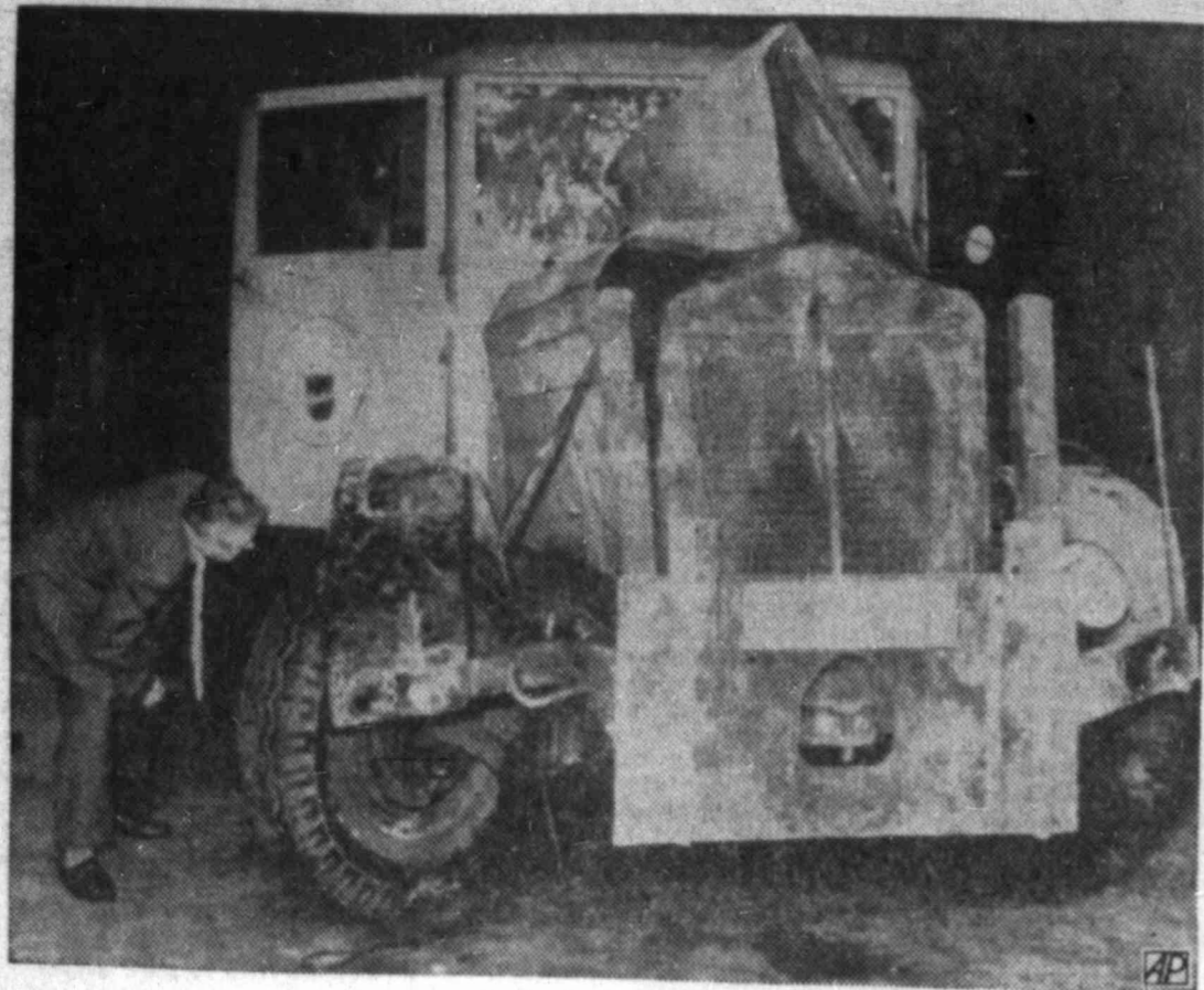
Reinforced For Clean Break

Inspection is made of an East Berlin cleaning department truck which was used by an eastern zone couple to break through the East German wall into the American zone and freedom. The driver reinforced the bumper of his heavy truck and placed wooden beams on the front. He drove home after work, picked up his wife and some household belongings and drove to Kopenickerstrasse. Driving at full speed, they crashed the truck through the wall and into the American sector.