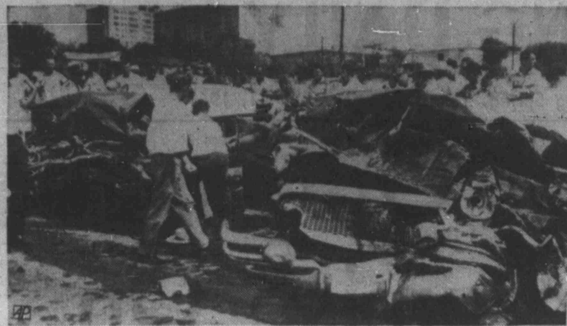
Four Die In Freeway Crash

NEW YORK (AP)—A federal judge has issued a 90-day Taft-Hartley law injunction against the national maritime strike which curtailed American-flag shipping for 18 days. The injunction—dated back to July 3 when a temporary restraining order ended the strike—bars any resumption of the walk-out until Sept. 21. A union lawyer said the order, issued Monday by U.S. Dist. Court Judge Sylvester J. Ryan, will be appealed to the U.S. Court of Appeals.