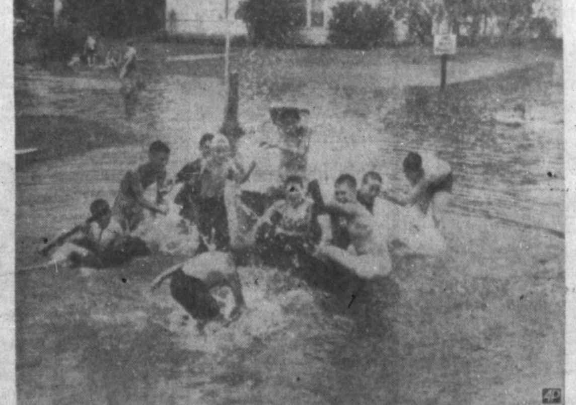
Showers Bring Summer Fun

MEXICO CITY (AP) — The tourist trade during April and May was the worst in years, the Mexican Tourist Association said Monday.