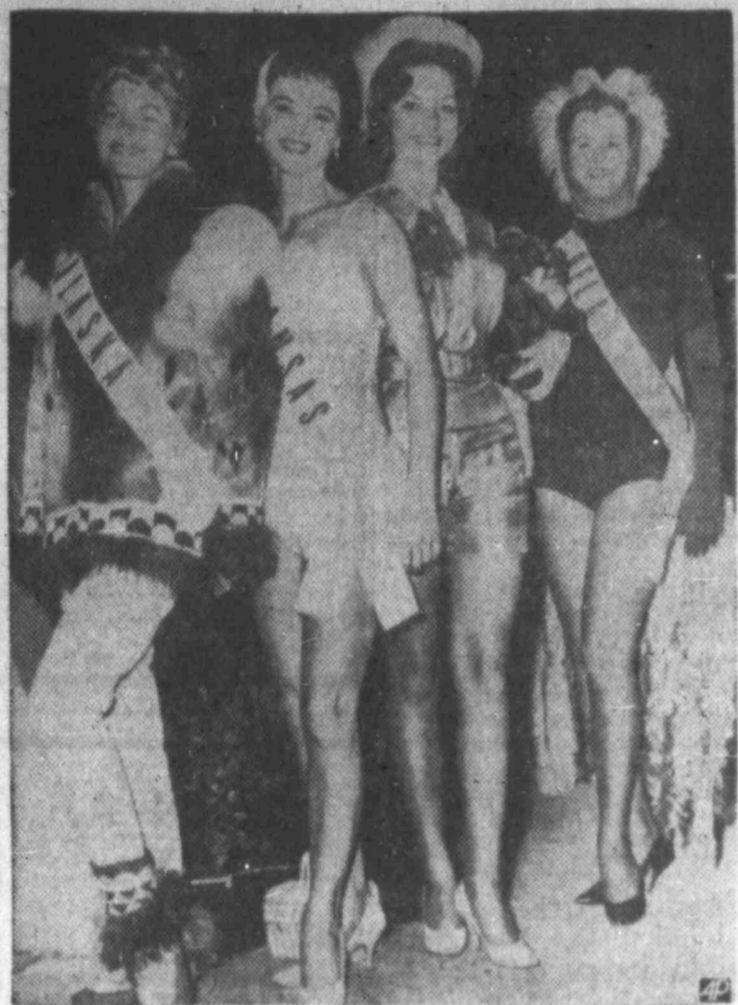
Miss Universe Beauties

Four stateside beauties competing for the Miss USA title and a chance at the Miss Universe crown are shown as they appeared at the opening of the Miss Universe Beauty Pageant at Miami.