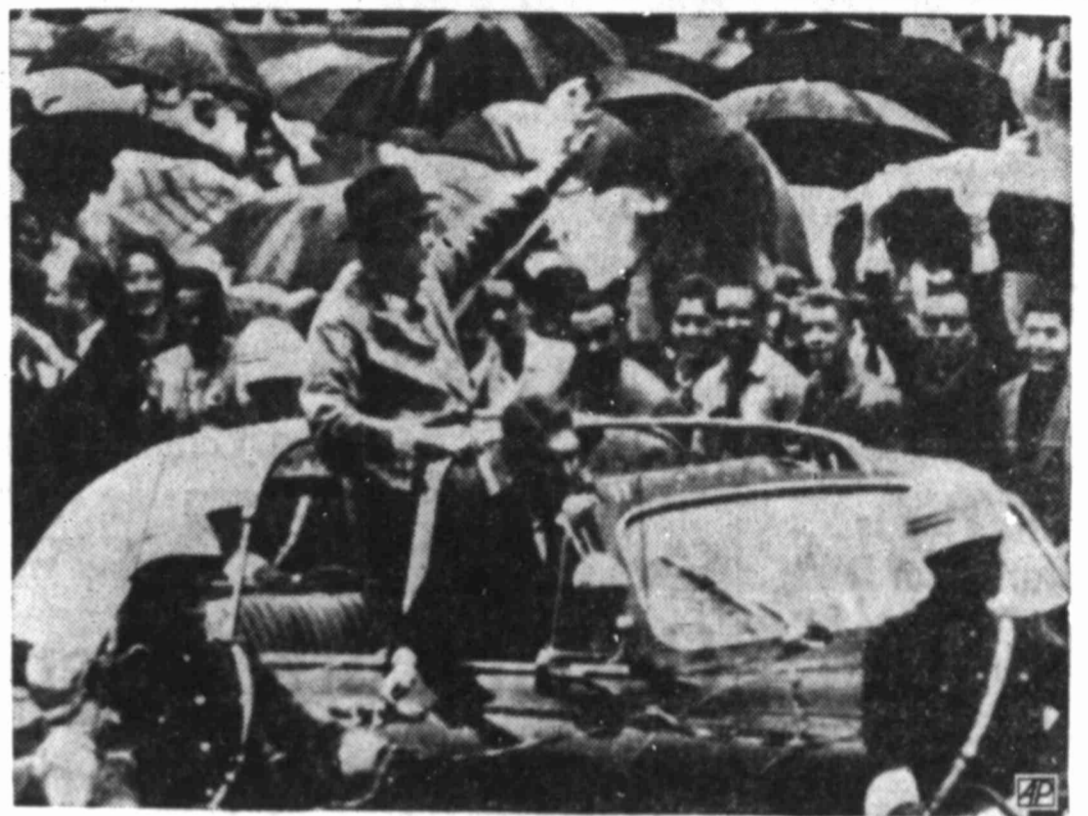
Damp Greeting For Ike

No chairman was named for the Driver Improvement School and members of the news media were named to handle CTC news promotion.