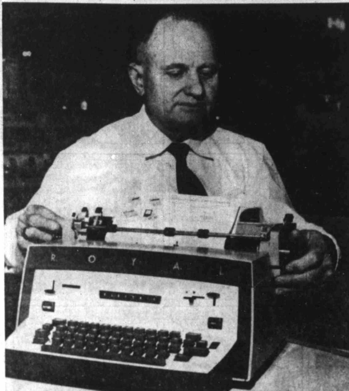
New Royal Electric

3-B Big Spring (Texas) Herald, Friday, February 26, 1960 3-B