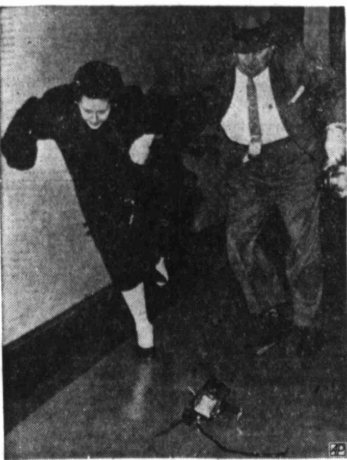
City Hall Tussle