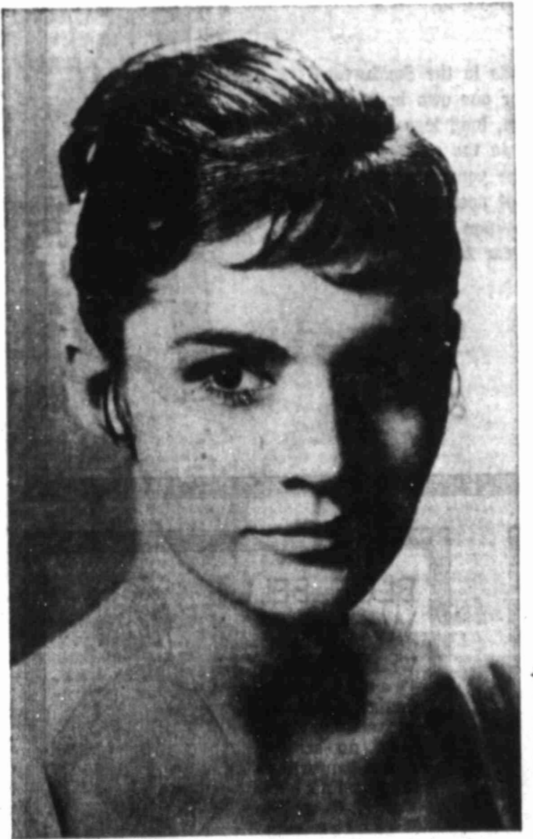
Acting Comes First