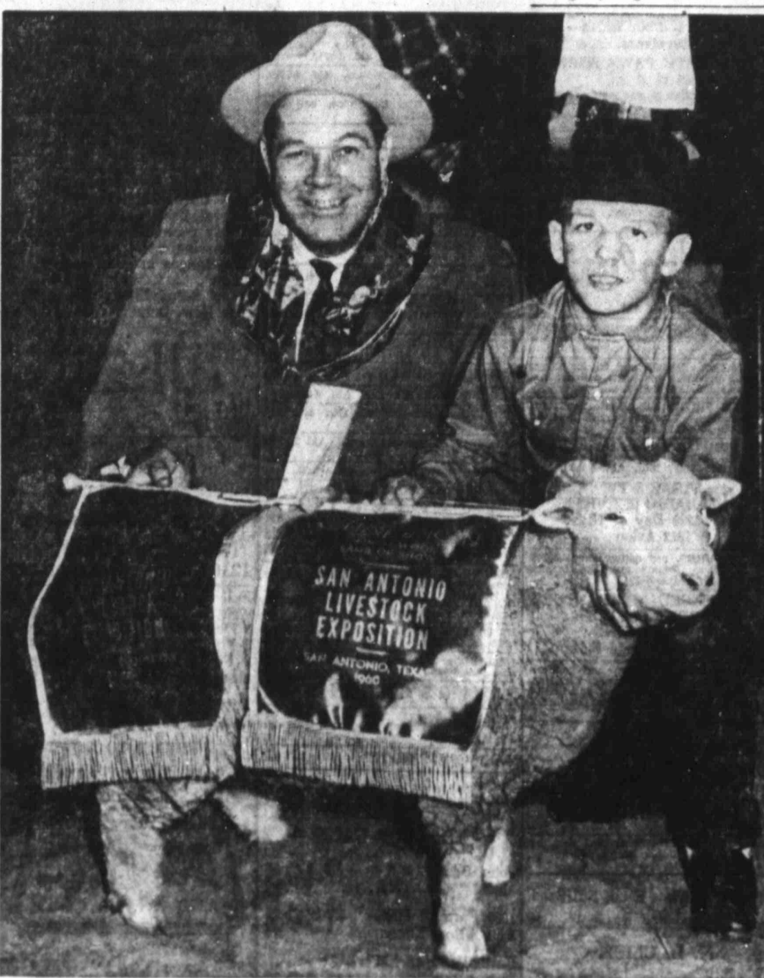
Like Golden Fleece

TOKYO (AP)—Japan's new royal baby has contracted a slight case of baby jaundice, but the doctors say that's normal for Japanese children.