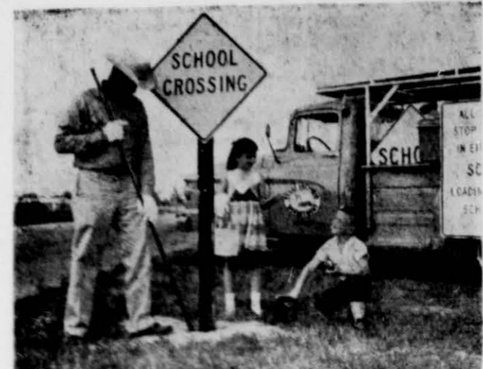
TEXAS HIGHWAY DEPARTMENT GETS READY FOR SCHOOL—A school bus is being inspected by a Highway Department inspector and school bus driver. Inspectors are urged to carefully observe these signs to guarantee the safety of school children.