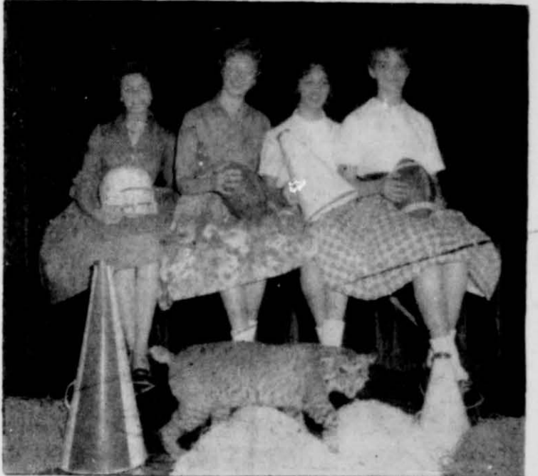
HOMECOMING QUEEN CANDIDATES: One of these young ladies will be chosen Homecoming Queen this year to help publicize the annual Dimmitt High School Homecoming October 6 and 7.