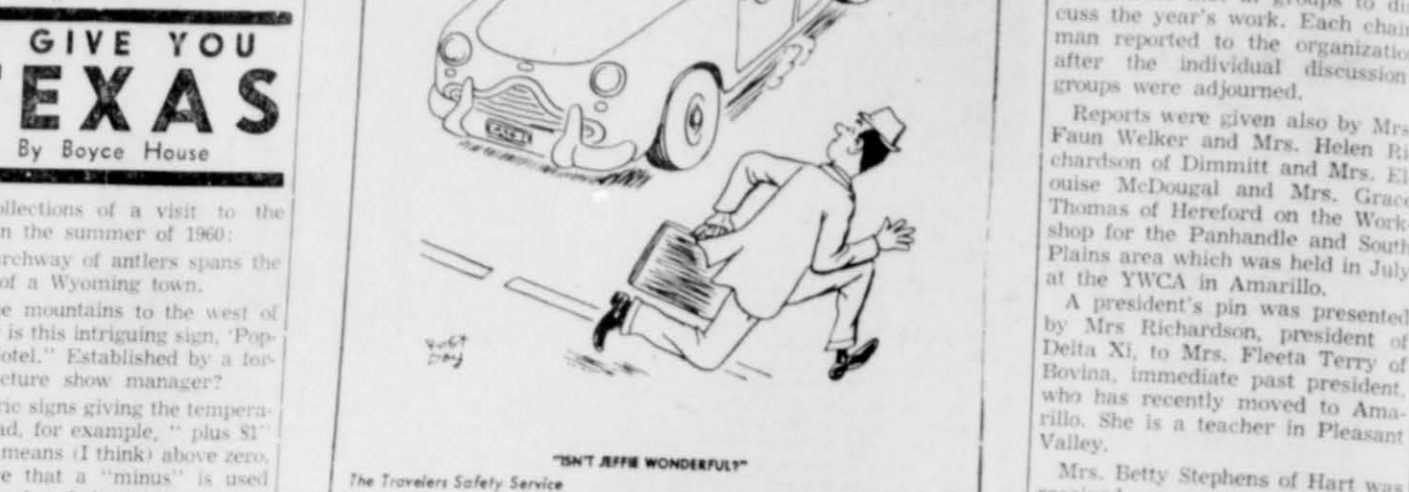
More than 27% of the drivers involved in fatal accidents in 1960 were under 25 years of age.