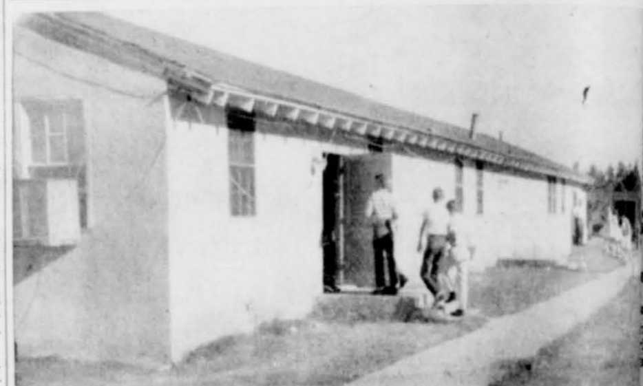
BAND HALL—This is the band hall at Dimmitt High School, a converted Westinghouse building. It is totally inadequate in size, lighting, acoustics and other considerations. School officials who have arranged for a new, modern band hall in the present school building to be decided on in a bond election October 7.