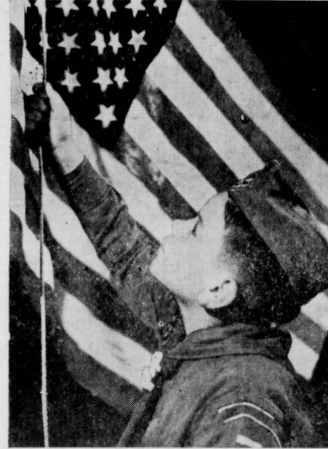
The nation's five million Cub Scouts, Boy Scouts, Explorers and adult leaders embark on a campaign to encourage all citizens to fly the United States flag at their homes on holidays. The Boy Scouts of America has always required its members to know the history of the United States flag and the proper ways to show respect for it.