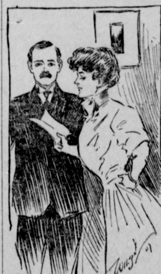
Sheet It Contained.

Several hours later as he stood before the mirror, he wondered why he could not decide on a tie.