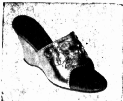
HOSTESS SLIPPER by Iris Jolie... exclusive with I. Miller in jeweled kid, white, blue or pink. 8.95: Gold... 10.95