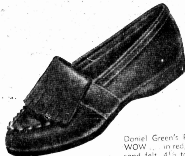
Daniel Green's POW WOW... in red, blue or sand felt. 4 1/2 to 10 AA and B... 6.00.