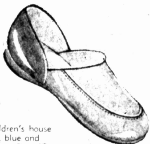
TERRY children's house shoe in red, blue and brown leather. 5 to 12 and 12 1/2 to 3... 3.95