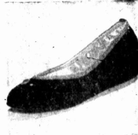
Jeweled flats for little girls... by Del's of California in velvet. Black or red with gold braid and jeweled toe... 4.50.

14 Big Spring (Texas) Herald, Wed, Dec 5 1956