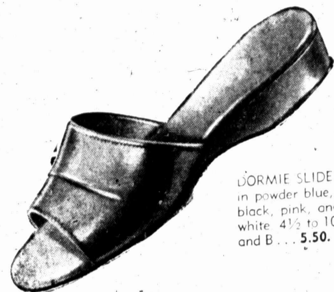
DORMIE SLIDE... in powder blue, red, black, pink, and white. 4 1/2 to 10 AA and B... 5.50.

Always a welcome gift... give from our selection of house shoes that will flatter the lady... comfort the man... and reflect the good taste of the giver.