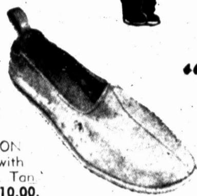
Daniel Hoy's SLIP-ON... glove leather with foam rubber insole. Tan 7 to 12, men's... 10.00.