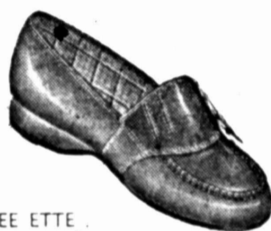
The DEE GEE ETTE by Daniel Greene. 4 1/2 to 10 AA and B... 6.95.