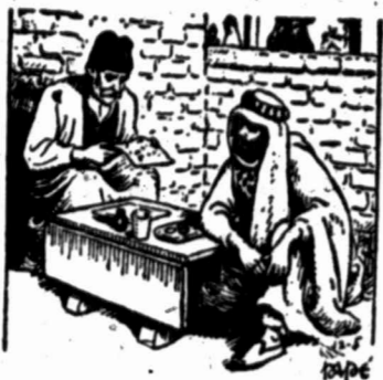
A scene in Baghdad.

All around Israel are neighbors of a different religion. The neighbors include Syria, Jordan and Iraq (also spelled Iraq). The people of those countries pray to Allah, the Moslem deity.