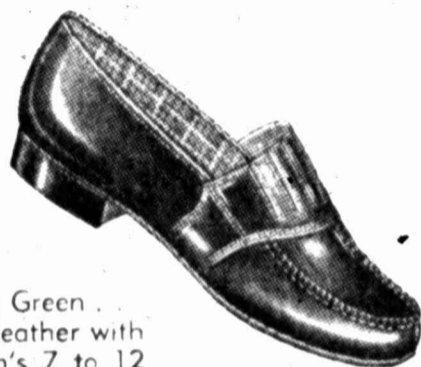
DEE GEE by Daniel Green... in black or brown leather with cordovan sole. Men's 7 to 12 B to D... 8.50.