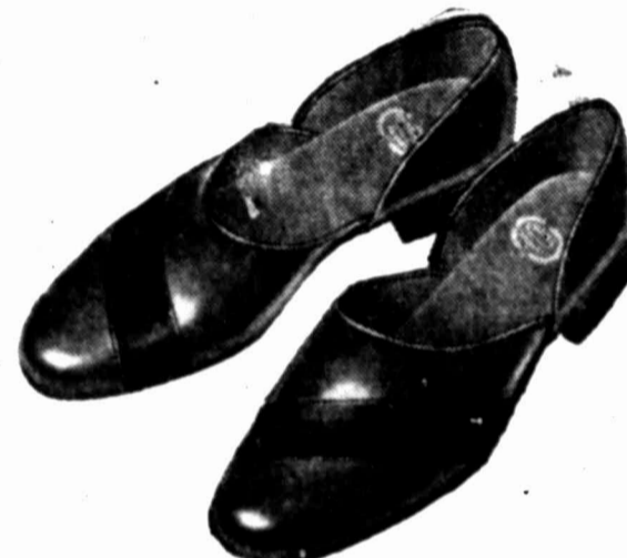
The AMBASSADOR by Evans... in tan kid leather with brown stripe. 7 to 12 A C and E... 7.95.