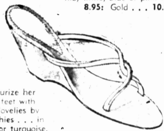
Glamourize her dainty feet with these lovelies by O'mphias... in white or turquoise. 4 1/2 to 9 N.M... 6.95