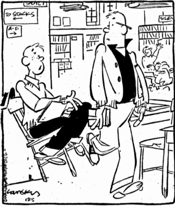
"If I'm studying when you come back... wake me up."