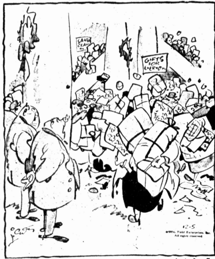
"How do you figure it, Seedy? ... Christmas shopping or prewar buying? ..."

IT'S NO CAT AND MOUSE STORY YOUR AD IN THE PICK A PRESENT WILL PAY DIVIDENDS DIAL AM 4-4331 Ask For Classified.