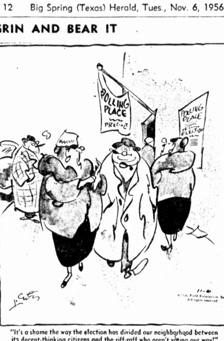
"It's a shame the way the election has divided our neighborhood between its decent-thinking citizens and the riff-raff who aren't voting our way!"