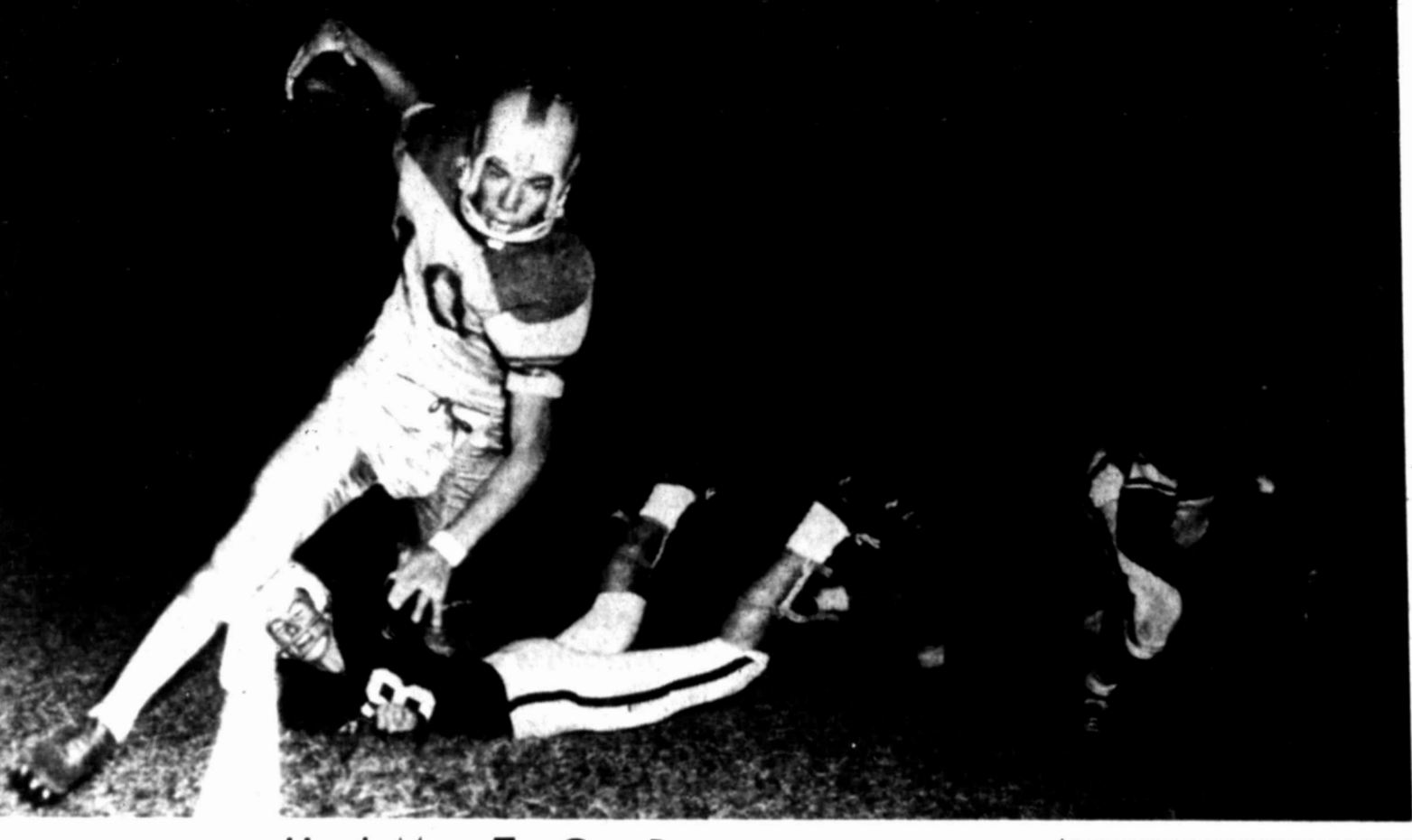
Hard Man To Get Down

DALLAS (P) — Basketball fans got a preview last night of what they can expect in the coming Southwest Conference season and it looked good.