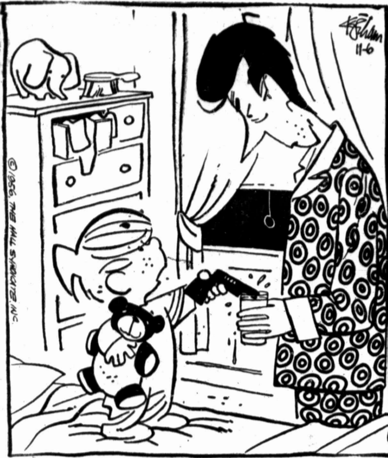
I DIDN'T SAY I WANTED A DRINK. I SAID I NEEDED SOME WATER!