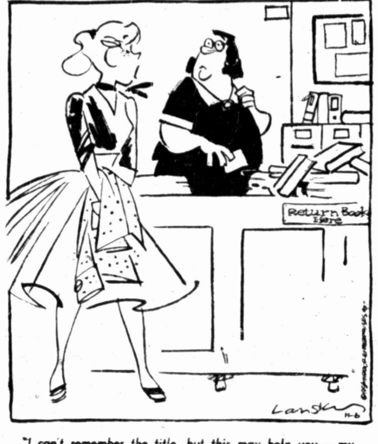
"I can't remember the title, but this may help you — my mother doesn't want me to read it!"