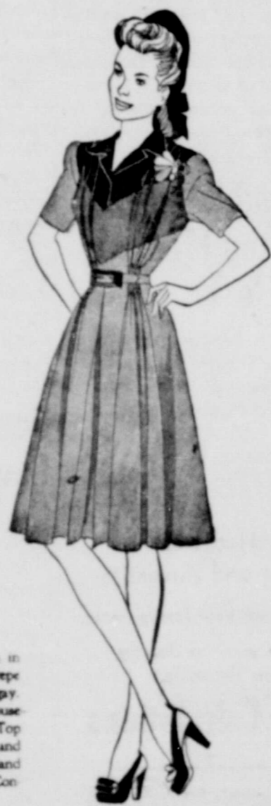
"Love Day" A high-colored dress in Shadow Box Rayon Crepe—three colors and very gay. In Watercolor with Grouse and Concarne. Grain Top with Bandana Green and Blue Flame. White Sand with Blue Grouse and Concarne. Sizes 11 to 15. $10.95