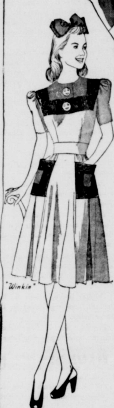
"Winkin" Tri-Color dress of Marvel-teca spun rayon. In Sand with Concarne Red and Bombay Luggage. Sand with Bombay Luggage and Bandana Green, Sand with Laguna Blue and Concarne Red. Sizes 9 to 15. $6.50

MADE BY Young Americans FOR Young Americans