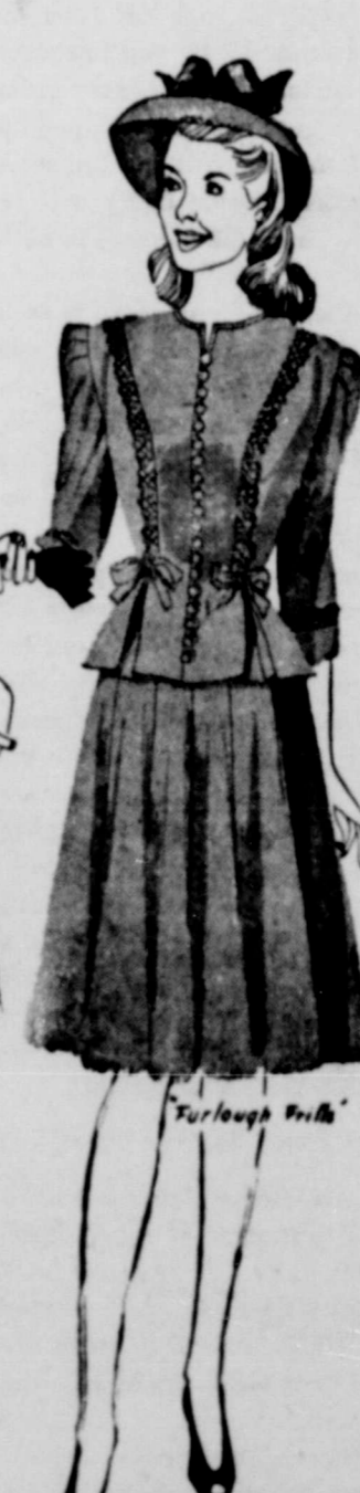
"Furlough Frills" Gay two-piece with a fitted princess jacket of Furlough Rayon Crepe. In Brabant Blue, Wheat, Peacock. Sizes 9 to 15. $12.95