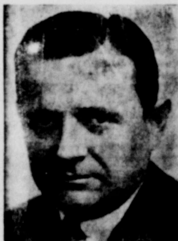
JAMES V. ALLRED

In the more than one hundred years of Texas history, Texas has never been represented in the United States Senate by a West Texan. This year, for the first time, you have an opportunity of electing a West Texan to that high position by voting for James V. Allred, who was born and grew to manhood in West Texas, and who knows and understands the problems of West Texans.