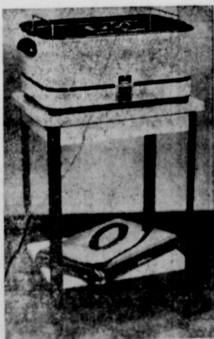
Roaster Model No. 855 on Welded Steel Cabinet, $23.95

Far Below "CEILING PRICE" IN COST Far Above "CEILING PRICE" IN QUALITY