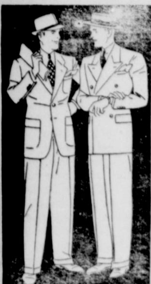
LUTHER FRY, TAILORING

With the vacation period about over and school scheduled to open September 6th, it is time for you to let us have your clothes so we may get them ready for you