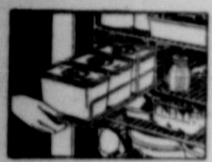
On a handy sliding shelf — The Triple Food Saver Set.

● Start with streamline styling... gleaming finish of High Bake Dulux... a welded all-steel cabinet reinforced with steel. Add to these such features as the big fast-freezing Froster, Triple Food Saver Set, Adjusto-shelf, improved Eject-o-Cube Ice Tray, and Built-in Utility Basket. Complete the list with the time-tested Hermetically-sealed Mechanism with 5 years' protection against service expense at only $5, included in the price. Outside values, inside values, performance values, and protection values in the new Westinghouse Golden Jubilee models make 1936 the greatest value year in refrigerator history.