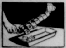
POP! Big, dry, zero-cold cubes from the Eject-o-Cube Tray.

● Start with streamline styling... gleaming finish of High Bake Dulux... a welded all-steel cabinet reinforced with steel. Add to these such features as the big fast-freezing Froster, Triple Food Saver Set, Adjusto-shelf, improved Eject-o-Cube Ice Tray, and Built-in Utility Basket. Complete the list with the time-tested Hermetically-sealed Mechanism with 5 years' protection against service expense at only $5, included in the price. Outside values, inside values, performance values, and protection values in the new Westinghouse Golden Jubilee models make 1936 the greatest value year in refrigerator history.