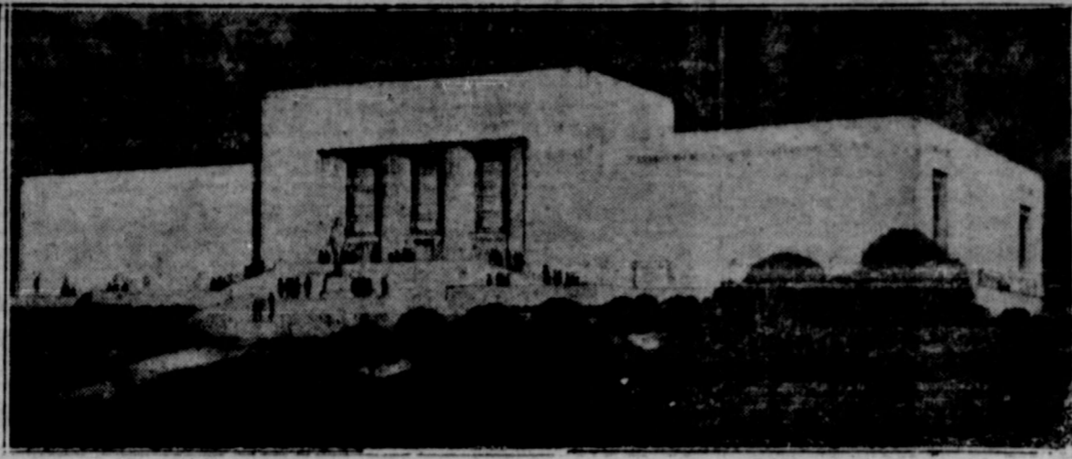
MILLION - DOLLAR TEXAS MEMORIAL MUSEUM