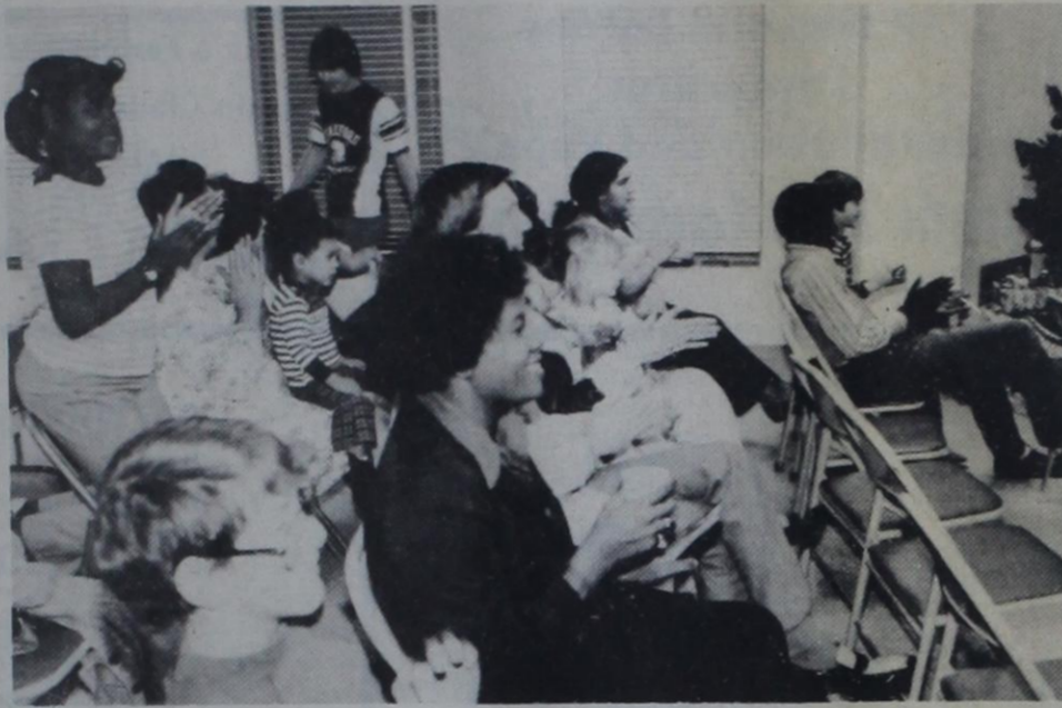
FOSTER CHILDREN and their foster families show at the foster children's annual Christmas party recently.

Your chances of dying from a heart attack or stroke are 50-50.