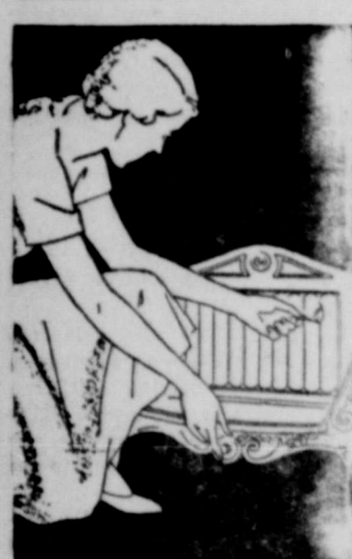
Instant Heat ... when you want it!

Patience is a virtue, but it doesn't thrive very well in a chilly atmosphere. When you're cold you want heat without waiting-comfort and health demand it.