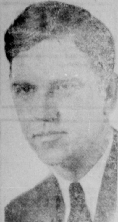
GEO. H. MAHON LEADS IN RACE FOR NINETEENTH DISTRICT CONGRESS