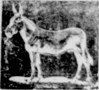
NOTICE TO STOCKMEN

Superflex Oil Burning Refrigerator Chills with oil heat. F. C. Harmon. 21-2tc