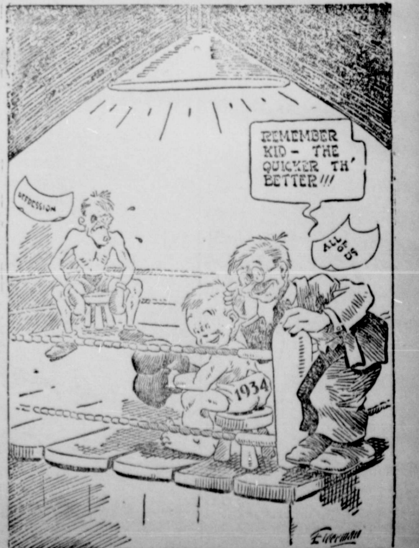
Kidman in Washington Post