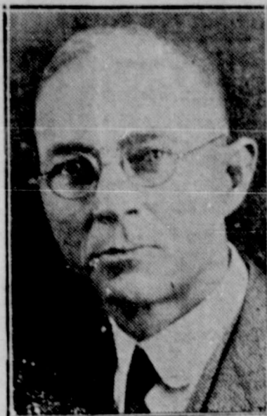
SENATOR ARTHUR P. DUGGAN

To the Citizens of the 19th Congressional District: