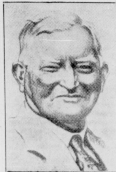
JOHN NANCE GARNER Vice President