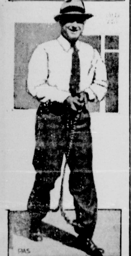
Machine-Gun Kelly, tries to laugh it off, but those chains and leg irons know no humor and the "bad man" of the middle-west comes to the end of the trail. Uncle Sam got him and plans on taking care of him in an efficient manner.