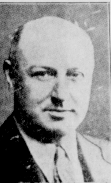
JAMES A. FARLEY Postmaster General

Paducah kicked to Floydada to start the game and Floydada after a series of plays punted to the Dragons. From then on the game belonged to the visitors. The first