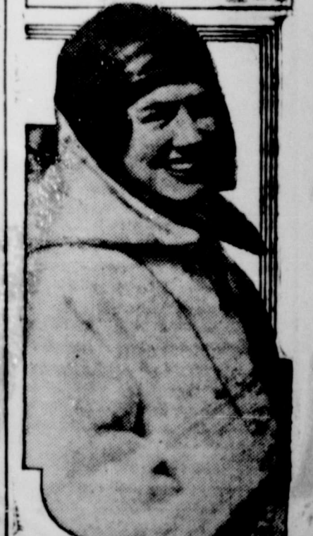
Mrs. Charles A. Lindbergh, wife of the noted Lone Eagle, who is now enroute home with her flying husband after hopping the Atlantic, poses in this picture, taken as they landed and she was received by Soviet officials at Leningrad Russia.