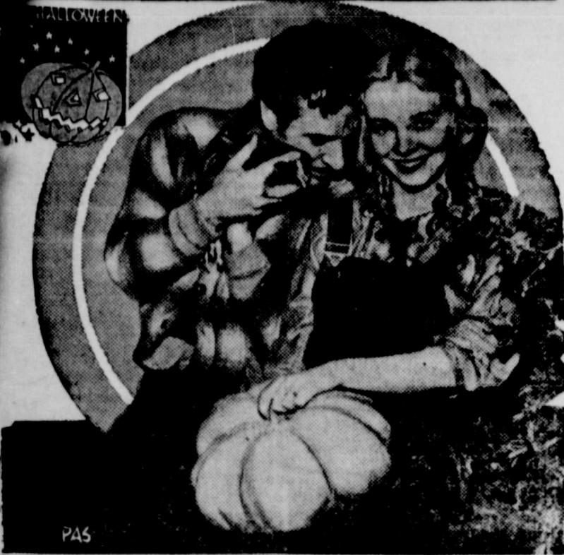
Revival of the old-fashioned barn dance is catching on throughout the country just as another Halloween night of frolic makes its appearance on the calendar. . . . The vogue started in the Hollywood movie colony. Here are shown John Gilbert and his wife, formerly Virginia Bruce, as they were photographed at a recent barn dance party.