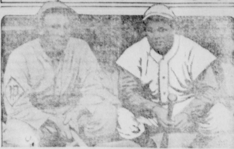
Here are the 1933 champion batsmen of the National and American Leagues. They are, left, Chuck Klein, outfielder of the Philadelphia National, and right, Jimmy Foxx, first baseman of the Philadelphia Americans. Klein's record reads, G-132, AB-696, R-101, Hits-223, Bat., 368. Foxx G-149, AB-571, R-125, Hits-204, Bat., 357 (unofficial).