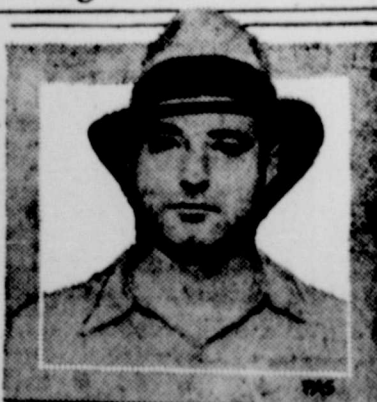
Above are the "Machine-Gun" Kellys, captured in Memphis and facing trial in Oklahoma. They are the last two members of the kidnaping gang, seven of whom were convicted for the kidnaping of Charles Urshel, oil baron.