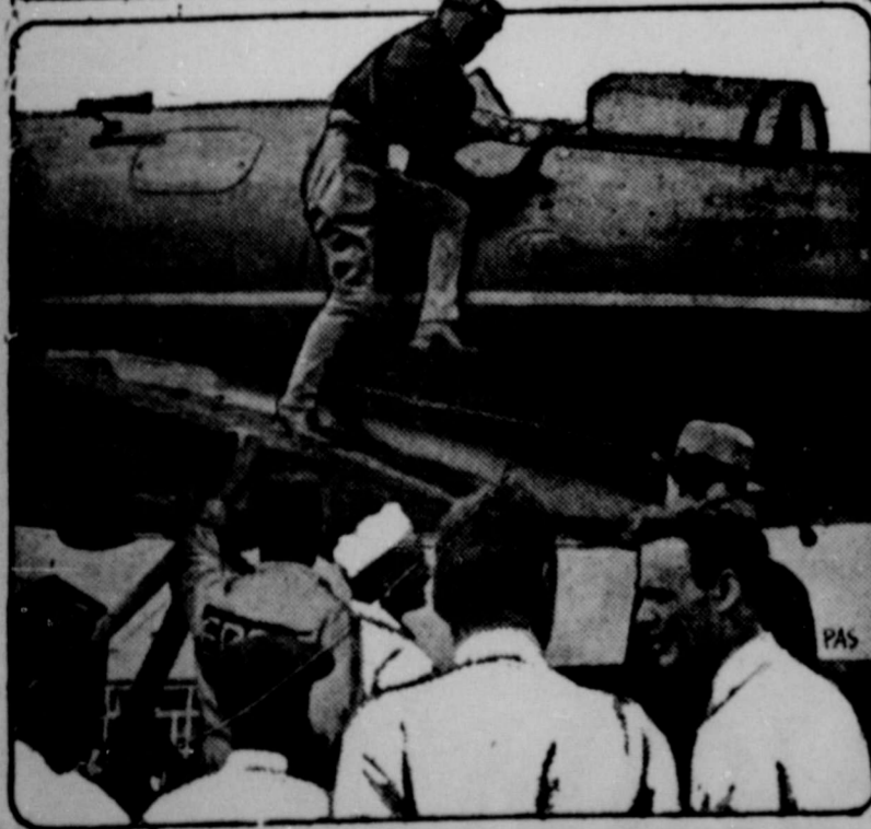
Here are the Lindberghs, Colonel and Mrs. Charles A., as they climbed in their plane for the take off from New York to survey a northern air route to Europe via Labrador, Greenland and Iceland. Mrs. Lindbergh, a radio operator and observer, is shown climbing into the plane. Col. Lindbergh is at the right in the foreground.