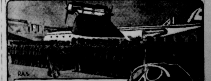
To the right is shown General Italo Balbo, Italian Minister of Aviation, who headed the Trans-Atlantic flight of a fleet of 24 huge flying boats from Lake Orbetello, Italy, to the World Fair at Chicago in hope from the continent to Iceland, Labrador and Canada. Above are shown the crews of the boats in review. Chicago planned a mammoth welcome for the flyers.