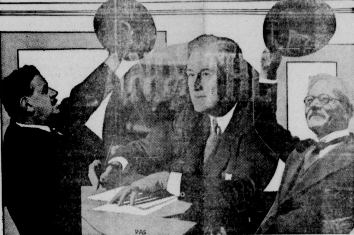
"Everything appears to be looking up" . . . was the gist of comment, semi-officially and otherwise, as Prime Minister, Ramsay MacDonald of England, right, and Edouard Herriot, France's envoy, left, waved adieu and sailed home, following their separate informal conferences with President Roosevelt, in which it is predicted agreements were reached which will considerably advance the prospects of success of both the Disarmament Conference and International Economic Conference within near future. It is hoped that steps have been taken under which a free international gold standard may be restored.