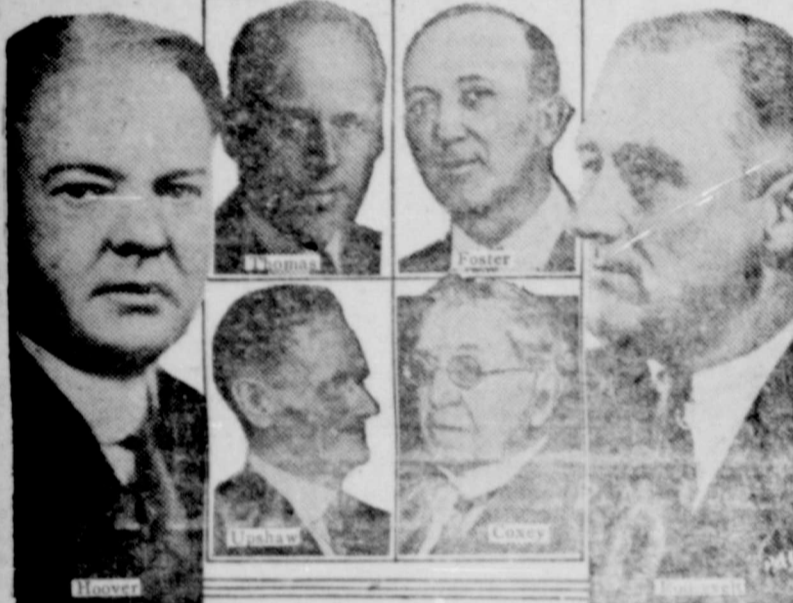
Hoover, Republican; Roosevelt, Democrat; Thomas, Socialist; Upshaw, Prohibition; Coxey, Farmer-Labor; Foster, Communist.