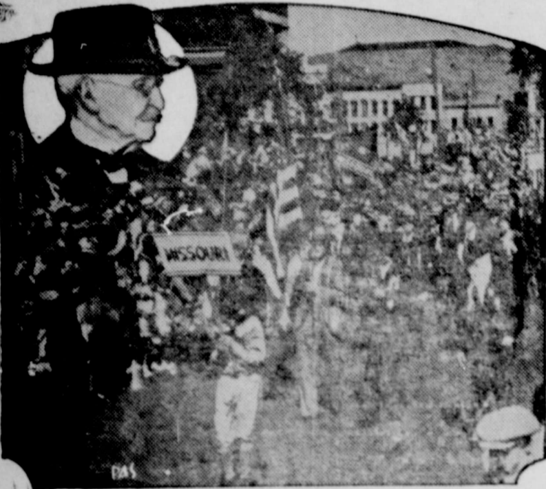
Seventy-five thousand people crowded into Springfield, Ill., home town of Abraham Lincoln, to witness 800 members of the Grand Army of the Republic in parade and annual convention.