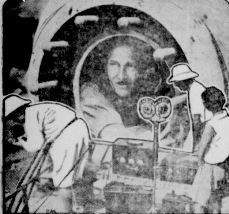
Dr. Wm Bebee, noted American deep-sea explorer, went to new depths, 2,200 feet, almost a half mile down, in a new bathysphere off Bermuda island, from where he broadcast by radio to millions of Americans about the wonders of the phosphorescent creatures habitating at that depth.