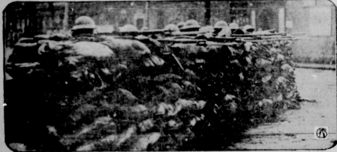
This is how the Japanese built up barricades of sandbags from behind which they shot down Chinese irregulars and civilians while the residents of the Foreign Colony looked on helplessly to interfere.