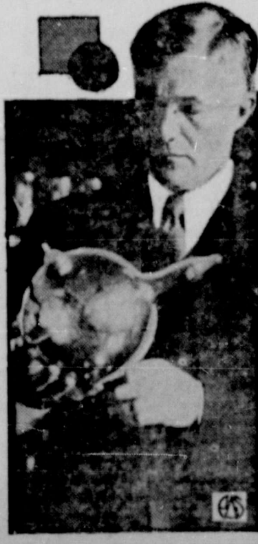
Dr. Irving Langmuir, wizard of electrons, got $10,000 cash and a gold medal for his improvements in electric lamps, vacuum tubes and electric welding.