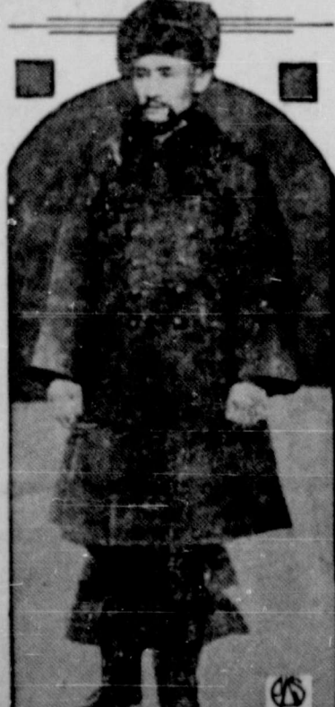
General Ma Chanshan, famous leader of Chinese forces against the Japanese whose death at the hands of an assassin is reported.