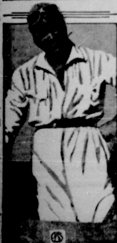
Sir Malcolm Campbell, who drove his motor car at a speed of over 253 miles an hour on the beach at Daytona, Florida.