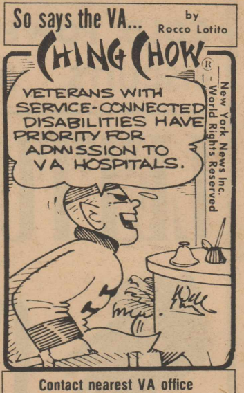
Contact nearest VA office (check your phone book) or a local veterans group.

They attend the Episcopal Church of Heavenly Rest. The family home is on Route 1, Tuscola.