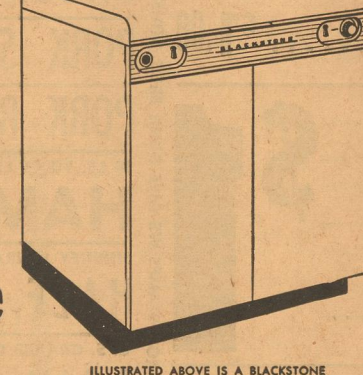
AUTOMATIC GAS CLOTHES DRYER.

Home economists estimate that the average homemaker will dry approximately 16 washer loads of clothes a week. Some of these loads will dry in five minutes. Other fabrics take as much time as an hour — or more — to dry. The average load requires about 30 to 35 minutes to dry. Gas for drying clothes costs approximately 1 cent an hour. Based on the above averages, it is estimated that the homemaker will use a dryer about five hours a week — or 260 hours a year. See your dealer .. a dryer that you can afford to use.