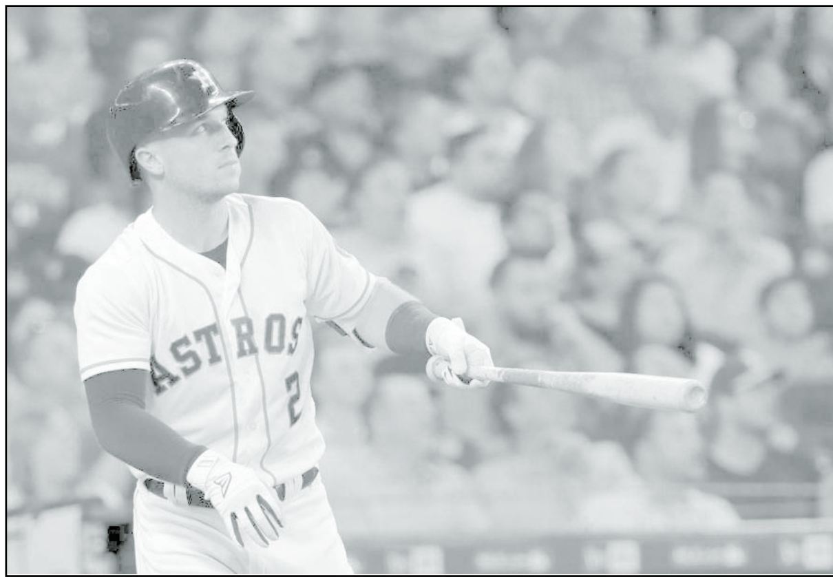
Houston Astros' Alex Bregman watches his home run against the Oakland Athletics during the first inning of a baseball game Tuesday, July 10, 2018, in Houston.

All-Star closer Blake Treinen (5-2) walked pinch-hitter Josh Reddick, who went to third on a single to right field by rookie Kyle Tucker. With