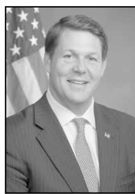
Congressman Jodey Arrington

Chairman of the House Veterans' Affairs Subcommittee on Economic Opportunity.