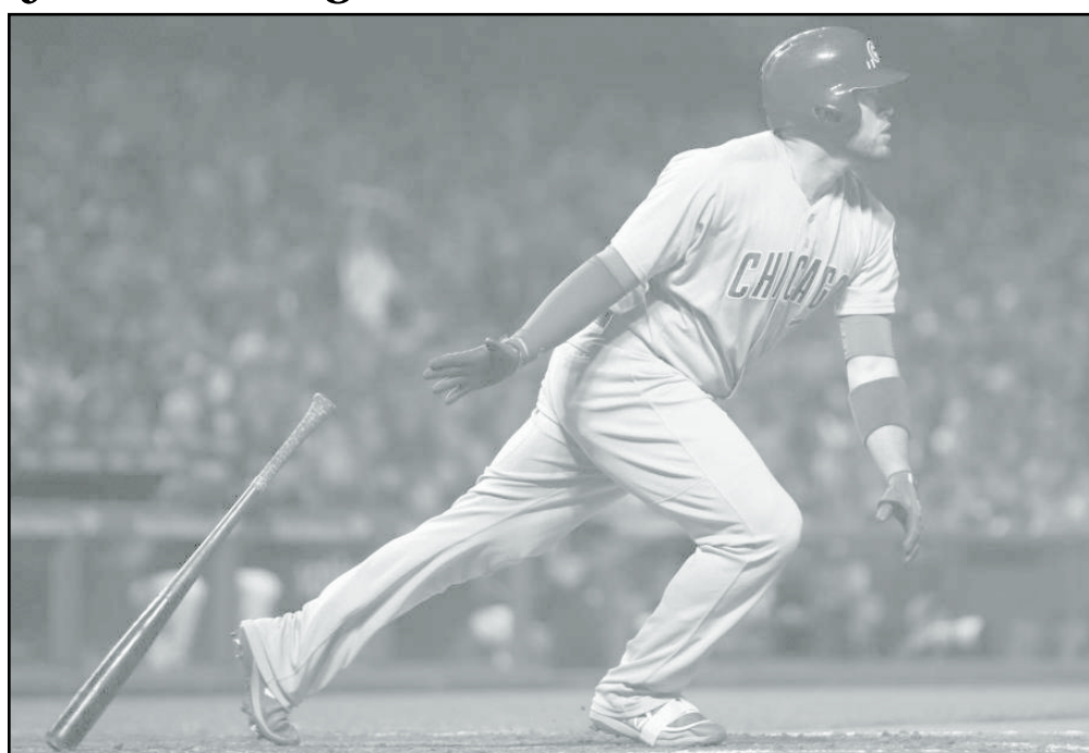
Chicago Cubs' Victor Caratini drops his bat after hitting an RBI double against the San Francisco Giants during the seventh inning of a baseball game Tuesday, July 10, 2018, in San Francisco.