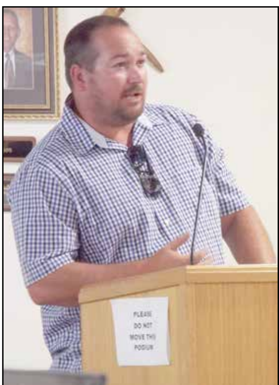
See CITY , Page 3

accepted." Through the discussion, it was revealed that the city's bid procedure called for companies to provide a cost for plumbing utility work on a per-foot basis, and gave no estimated quantities for how many feet would be replaced by the company during the project. "The more you do, it drastically affects the