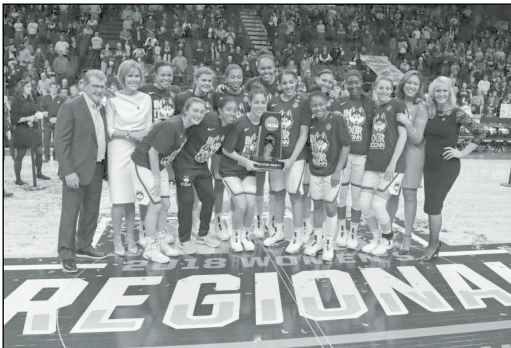
Connecticut head coach Geno Auriemma, left, poses for photographs with his team following a women's NCAA college basketball tournament regional final game against South Carolina at the a women's NCAA college basketball tournament Monday, March 26, 2018, in Albany, N.Y. Connecticut won 94-65.

"Every team starts the season saying that's our goal to go to the Final Four. For us, it's an opportunity to go back to where we felt like we didn't really give our best effort," UConn coach Geno Auriemma said. "We lost to a really good team. Happened in a way that was really, really disappointing. I know that we were anxious to go back and put ourselves in that same