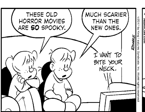
THESE OLD HORROR MOVIES ARE SO SPOOKY. MUCH SCARIER THAN THE NEW ONES. I WANT TO BITE YOUR NECK.