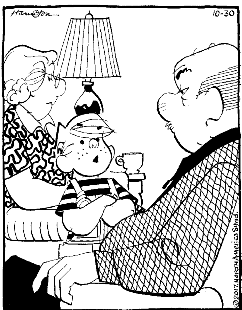
"So, you're tellin' me you hate gettin' older... but you like livin' longer?"