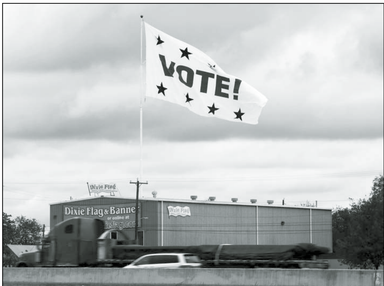
In this Nov. 8, 2016, file photo, a huge "Vote!" flag waves above Interstate 35 as motorists pass, in San Antonio. Texas voters are being asked to approve or reject seven proposed amendments to the state constitution in upcoming elections. They deal with everything from property tax exemptions to looser home equity loan rules to sports raffles and savings accounts that offer prizes for opening them. The Legislature had proposed 673 constitutional amendments, with 491 approved by voters, 179 defeated and three failing to make the ballot for "reasons that are historically obscure," according to the Texas Legislative Council.