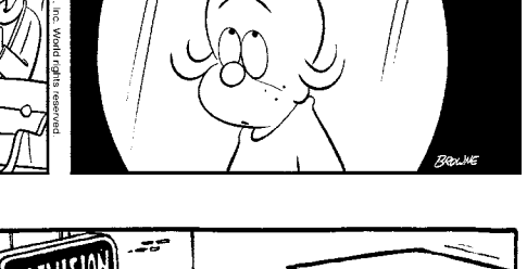
"THERE MIGHT BE ENOUGH FOR A MUSTACHE."