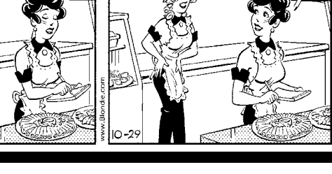
"I LOOKED AROUND, BUT I COULDN'T FIND A SINGLE THING THAT CAUGHT MY EYE."