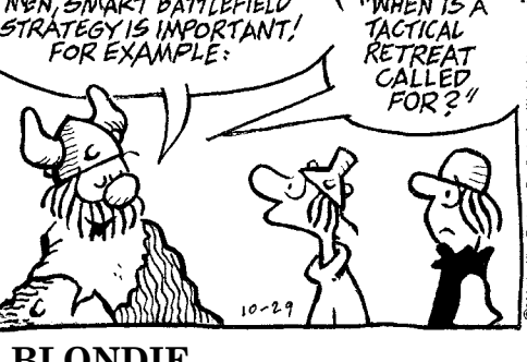
"WHEN IS A TACTICAL RETREAT CALLED FOR?"