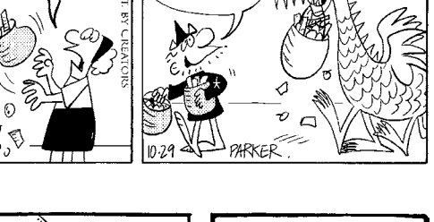
"WHEN I GET MY FIRST HAIRCUT, I WANT TO DONATE MY HAIR TO 'LOCKS OF LOVE.'"