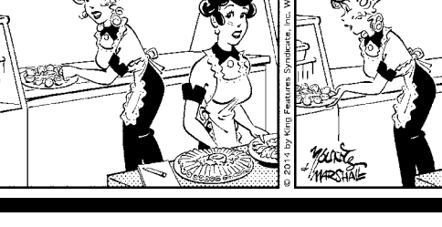
"I SPENT MOST OF THE MORNING AT THE NEW MALL."