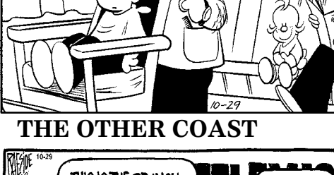
"YOUR TURN, LOUISE!"