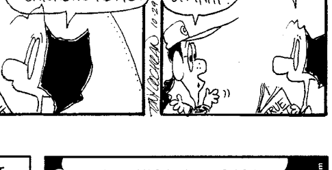
"MISTOPHER HINKS, ARE YOU TH' PERPETRATOR?"