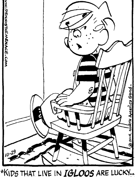
"KIDS THAT LIVE IN IGLOOS ARE LUCKY... THEY DON'T HAVE ANY CORNERS TO SIT IN!"