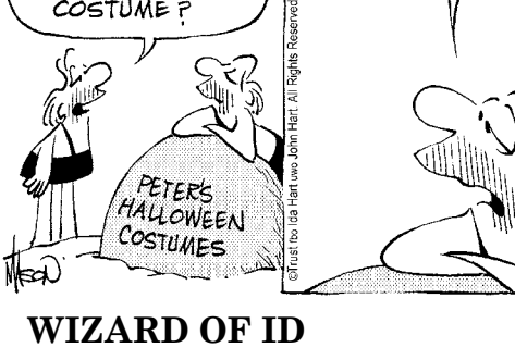
"DO YOU HAVE AN 'INVISIBLE MAN' COSTUME?"