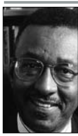
WALTER E. WILLIAMS

Roger Simon is Politico's chief political columnist. His new e-book, "Reckoning: Campaign 2012 and the Fight for the Soul of America," can be found on Amazon.com, BN.com and iTunes. To find out more about Roger Simon and read features by other Creators writers and cartoonists, visit the Creators Web page at www.creators.com .