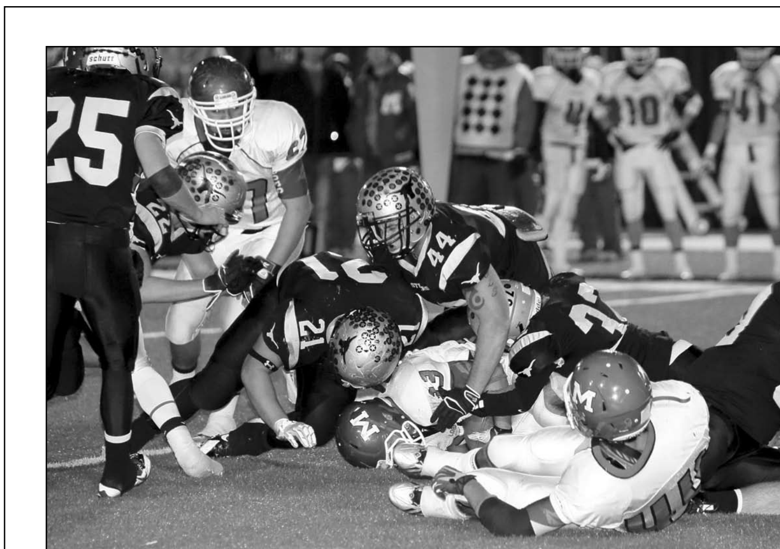
The Big Spring High School Steers will play five road games this season, including a Aug. 30 season opener against Kerrville High School in San Angelo. The Steers will begin preseason drills on Aug. 4 with non-contact drills.

This kind of attention and hype would have been unimaginable not just in 1990, when the U.S. returned to the World Cup after a 40-year absence, but even as recently as 2010.