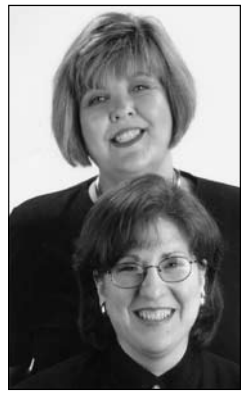
KATHY MITCHELL MARCY SUGAR

Dear Annie: My husband of four years insists on keeping a picture of his cat as the screensaver on his cellphone. Occasionally, he'll switch it out for a photo of one of his kids, but the cat always comes back as the "top dog." It's never a picture of me.