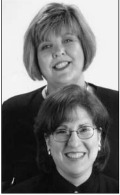
KATHY MITCHELL MARCY SUGAR