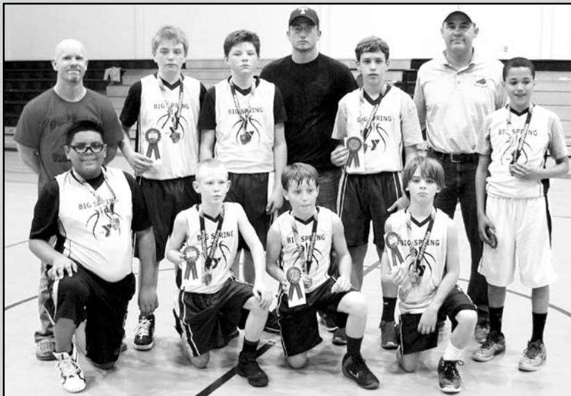
The Stanton Buffaloes won the BSYBL 5th-6th grade division championship on Saturday. The team completed a perfect season by defeating Duke 37-24, in the BSJHS gym.

Stanton blew the game open in the third. The Buffaloes, sparked by a pair of shots from