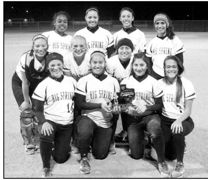
The Big Spring Lady Steers pose with the consolation trophy from the Tournament of the Crossroads on Saturday evening. The Lady Steers defeated Colorado City, 9-2, to earn the trophy.

The Lady Steers' offense was aided by stellar defensive play from See TOURNEY , Page 10