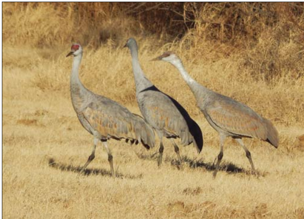
Sandhill cranes, a familiar sight during the winter, were in abundance at One Mile Lake (the Sandhill Crane Sanctuary and observation area) early Saturday. According to Wikipedia, Sandhill cranes are fairly social birds that are usually encountered in pairs or family groups through the year. During migration and winter, non-related cranes come together to form "survival groups" which forage and roost together. Such groups often result in thousands of cranes being found together.