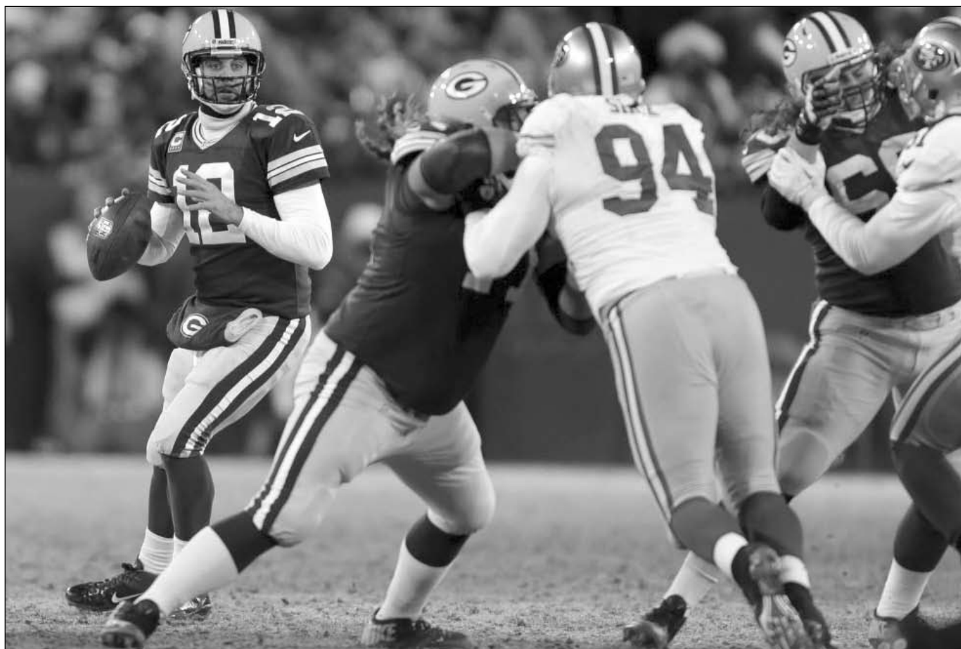
Green Bay quarterback Aaron Rodgers (12) looks for a receiver during his team's NFC playoff game against San Francisco Sunday.