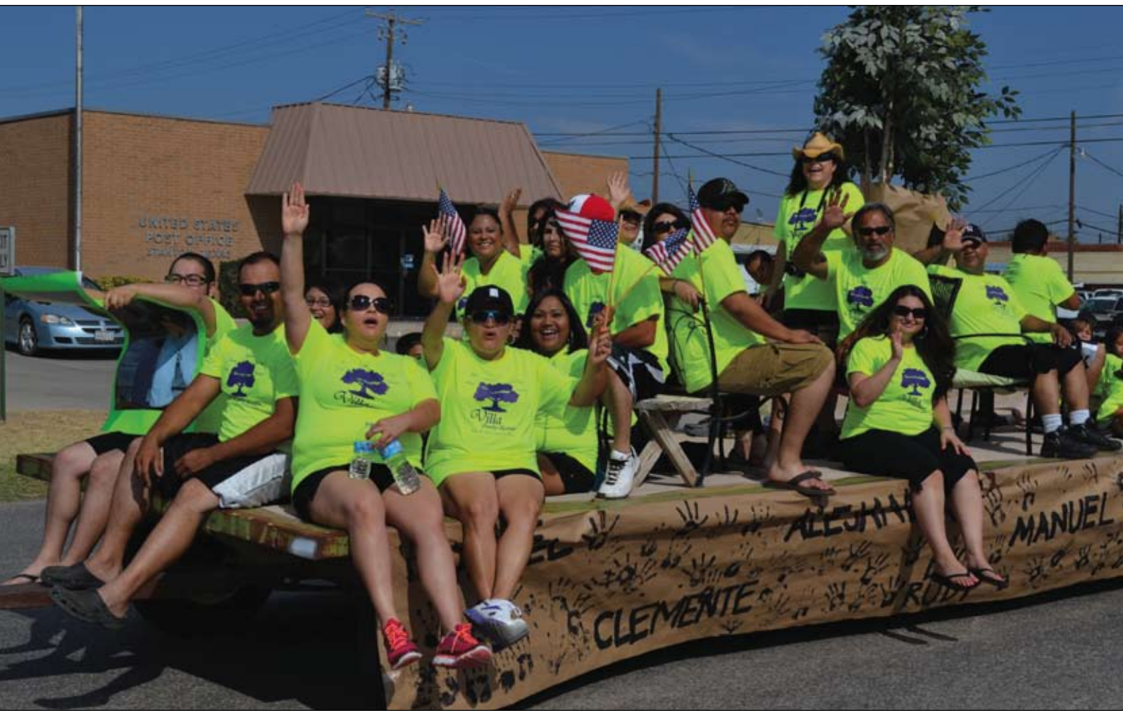
Revelers cheer from a float during the 79th Martin County Old Settlers Reunion held Saturday in downtown Stanton. Various events were scheduled throughout the day, concluding with an evening dance.

Average retail gasoline prices in Texas have risen 4.2 cents per gallon in the past week, averaging $3.23/g Sunday. This compares with the national average that has not moved in the last week to $3.42/g, according to gasoline price website TexasGasPrices.com. Including the change in gas prices in Texas during the past week, prices Sunday were 34.5 cents per gallon lower than the same day one year ago and are 4.3 cents per gallon lower than a month ago. The national average has decreased 11.0 cents per gallon during the last month and stands 24.7 cents per gallon lower than this day one year ago. "Those who stuck around the low gas price party expecting it to last have realized they're out in the cold," said GasBuddy.com Senior Petroleum Analyst Patrick DeHaan. "Oil prices are well off their recent lows, and we'll likely continue to see the national average rise in response. Most regions should see prices rising, while the Rockies areas may see any increase take considerably longer to arrive," DeHaan said.