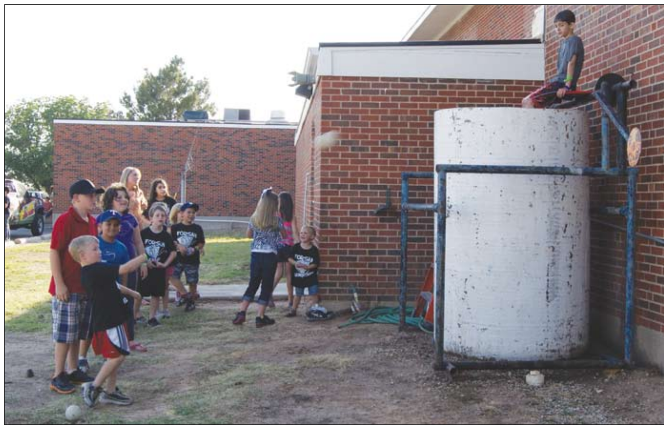
Elbow Elementary students and parents enjoyed end of year fun at Family Fun Night. The event is held annually as a way of ending the school year. Families were able to enjoy a cake walk, Coke toss, video game trailer, dunking booth and more. Above: Students test their aim at the dunking booth. Right: Several of the students enjoyed jumping on the inflatable houses and obstacle courses.