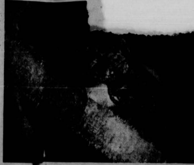
Portrait of the Squash Bug. This ominous looking creature, more commonly known as the "blob bug," attacks all cotton areas, sucking plant juices and destroying the plant's vitality.