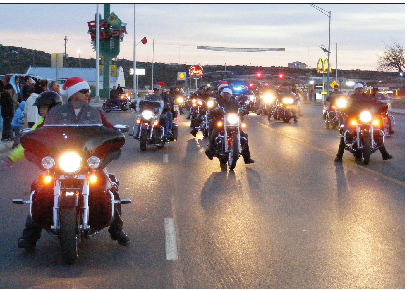
Motorcycles thunder down Gregg Street during the Lighted Community Christmas Parade, sponsored by the Big Spring Herald. The parade was held Saturday.