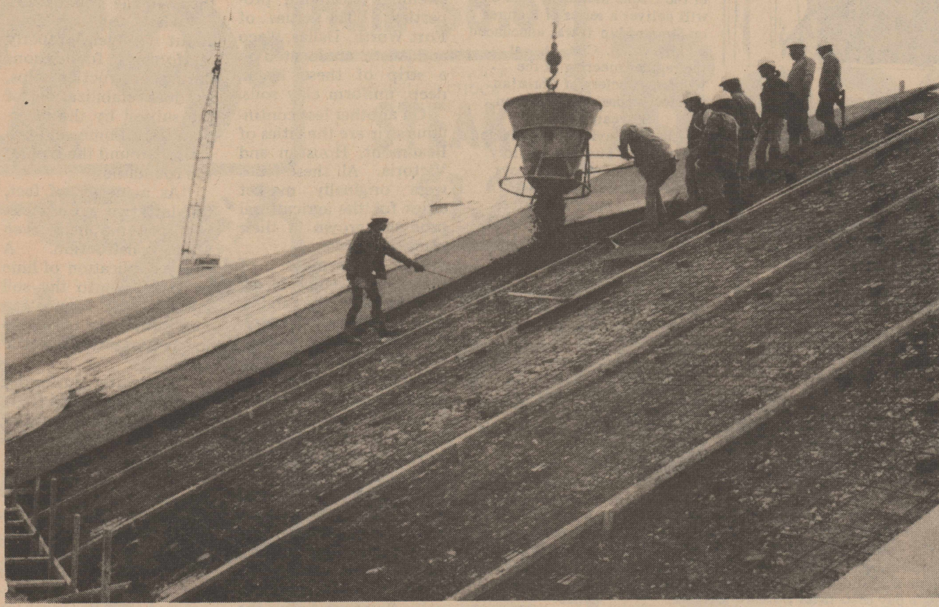
AROUND 5,000 YARDS OF CONCRETE will have been used when both sides of the dirt elevation of IS-10 through Ozona have been covered. Zachry Co. workers are pouring concrete with speed here Tuesday afternoon in anticipation of a front which is supposed to bring bad weather to the area. Both sides had been completed to the Gurley Draw bridge by late Tuesday. Dry weather has aided the concrete workers. A wet front would shut operations down until dry weather set in for several days.