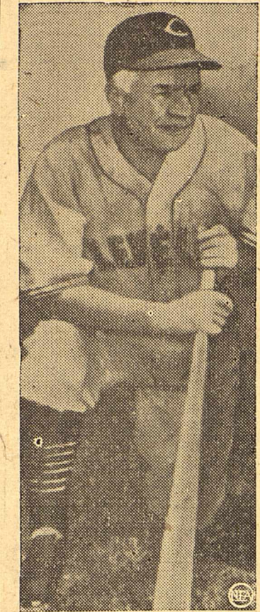
Tris Speaker, famous in other days, rejoins Cleveland Indians in Tucson, Ariz., training camp to show how centerfield should be played. He ought to know.