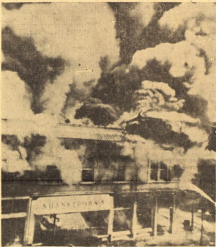
More than a 100 guests fled this four-story building in Clarksdale, Miss., when fire badly damaged the Hotel Alcazar's three top floors and destroyed four business concerns in adjoining annex. This is a view of the flaming building shortly after the fire broke out. No injuries were reported.

Try fast working want-ads to sell those extra items you have.