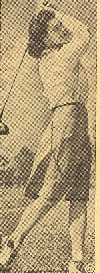
Mrs. Babe Didrikson Zaharias, national champion, gets off long one as heavy favorite in Miami's Helen Lee Doherty tournament in which famous all-around athlete was medalist with three-under-men's-par 68.

The Japanese shod their horses with straw slippers, until the nineteenth century.